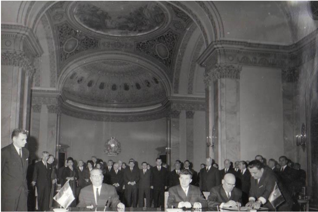
Figure 2. The former Throne Hall. The signing ceremony of the common declaration regarding the visit to Romania of Josip Broz Tito, the President of the Socialist Federal Republic of Yugoslavia. One can see the emblem of the socialist republic in the place where once the canopy overarched the throne, and the two surviving ceiling decorations (the frieze with armorial bearings and the fresco).

Communist Party, investiture ceremonies (Fototeca Online a Comunismului Românesc n.d.). For example, in April 1966, a meeting between Josip Broz Tito, the President of the Socialist Federal Republic of Yugoslavia, and Nicolae Ceaușescu, Secretary General of the Romanian Communist Party, took place in the former Throne Hall.