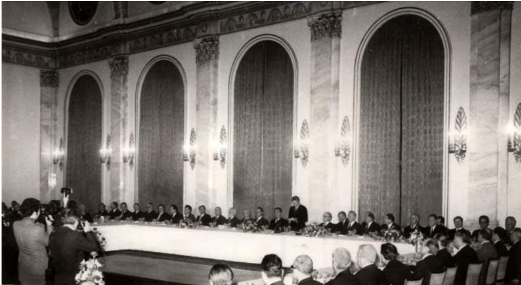
Figure 3. The meeting of the Council of the Political Consultative Committee of the states participating in the Warsaw Treaty. The official breakfast held in the former Royal Hall, 25-26 November 1976. Notice that King Ferdinand I's portrait, formerly hanging on the wall on the left side of the photo, was removed.

Pressmark: 332/1976