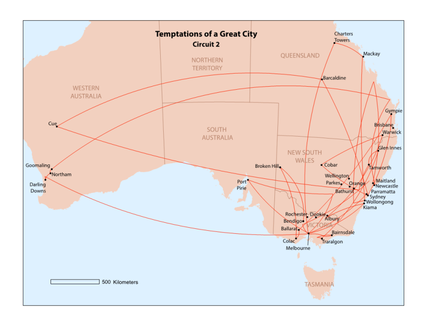
Figure 4: Temptations of a Great City, Circuit 2