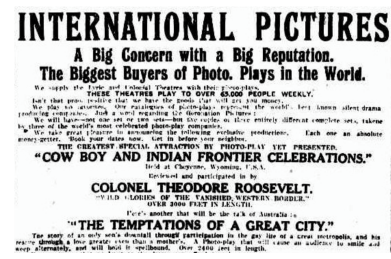
Figure 2: Ad for Temptations of a Great City in Referee (Sydney), 12 July 1911. 20 Referee (Sydney, NSW), July 26, 1911,