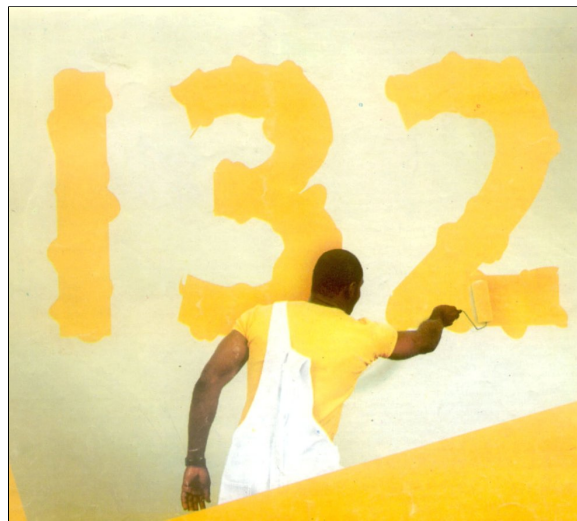
Figure 2. 'MTN Man' propagating the Y'ello message.

Still deploying the y'ello signifier, the company uses a product character popularly known as 'the MTN man'. He is commissioned in the commercials to transmit the y'ello message from cities to towns and villages, as he paints billboards and demarcates highways with the colour yellow to signify the connection of such locations to the MTN network. One intriguing aspect of the advert is the " y'ello magic" signifier as reflected in two major codes.