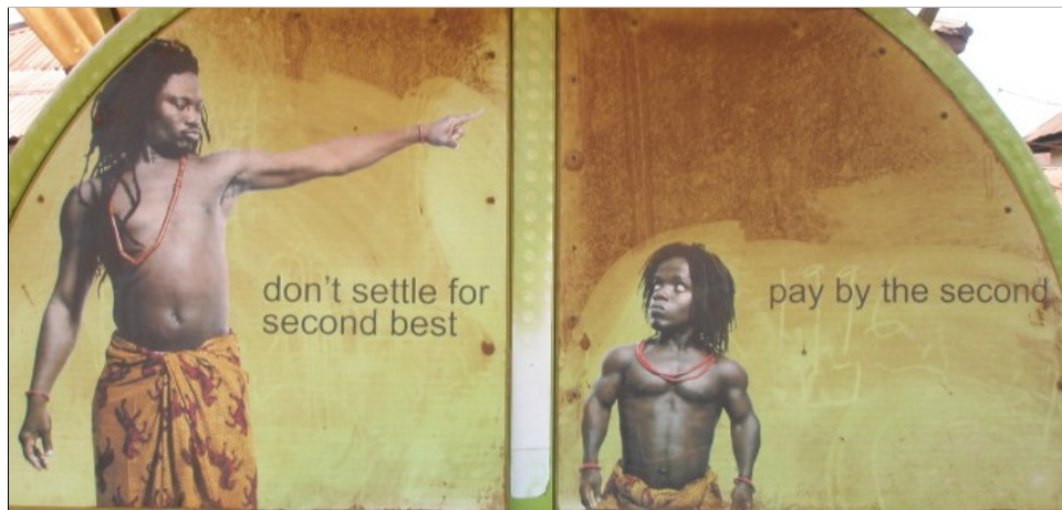
Figure 7. Daddy Showkey sending the copycat dwarf packing from the stage.

Consequently, when Globacom broke the jinx in 2003 by introducing the per second billing, it was a great relief to its subscribers. We can, therefore, read the import of ‘now’ in the extract ‘Now you can pay per second’. To further reinforce the verbal signifier ‘now’, there is interplay between verbal and visual signs. How it is instrumentalized here is interesting. In an advert, Charley Boy (Charles Oputa), a popular Nigerian musician, buys a banana from a hawker, peels just one, eats it halfway, returns the remaining half to the seller and collects change. The eaten portion of the banana is a symbolic sign for the number of seconds a subscriber could spend on the phone, while the returned uneaten portion symbolizes the remaining unused seconds which the service provider does not need to charge the subscriber for, hence the banana seller’s resolve to give Charley Boy some change. Similarly, the money paid for the banana is a symbol for the subscriber’s credit value which has to be deducted commensurate with the number of seconds used.