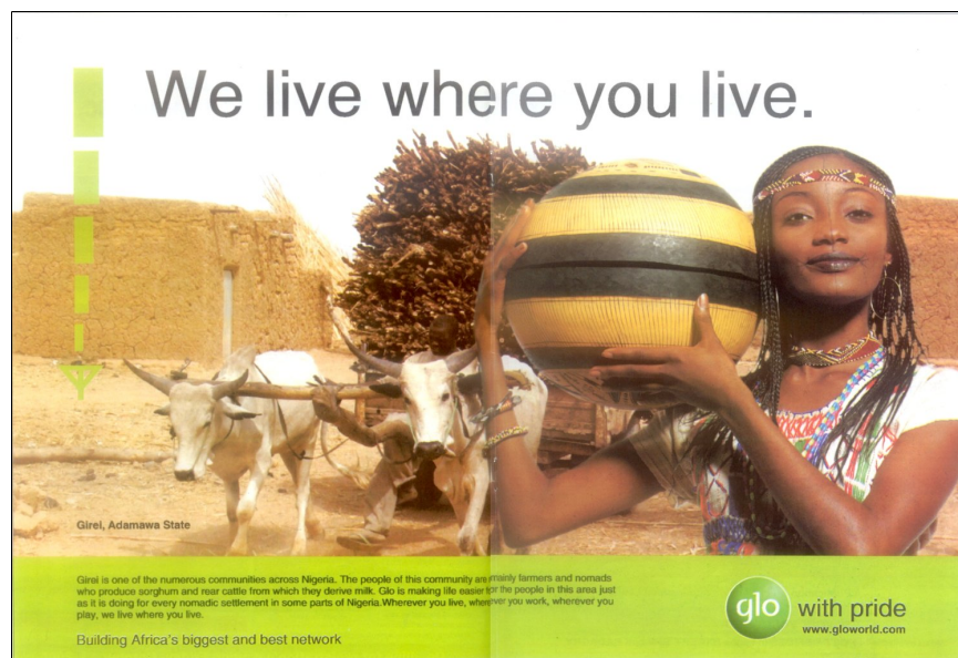
Figure 4. A typical Hausa-Fulani village setting in northern Nigeria.

The advertisers' predilection for the use of the deictic markers 'where', 'wherever', and 'everywhere' is predicated on the fact that they want to give the impression that they are capable of connecting urban centres to the rural areas, as subscribers living and working in urban centres would wish to keep in touch with people back at home in the hinterland. To further emphasize the mobile service providers' bid to connect the urban to the rural, spatial deictic markers are reinforced with non-verbal indexical surrogates. Such indices revolve around diverse cultural units such as occupations for which rural communities are noted. The occupations touch on cattle rearing, fishing/fish smoking, garri (cassava flour) processing, hand weaving, tying and dyeing of textile materials, farming with crude implements such as hoes and cutlasses, pounding with mortar and pestle, harvesting of palm fruit, among others. Apart from cultural units in the form of occupational engagements, there are pictorial images in the form of landscapes, showing thatch roofs, deserts, forests, creeks, and so on.