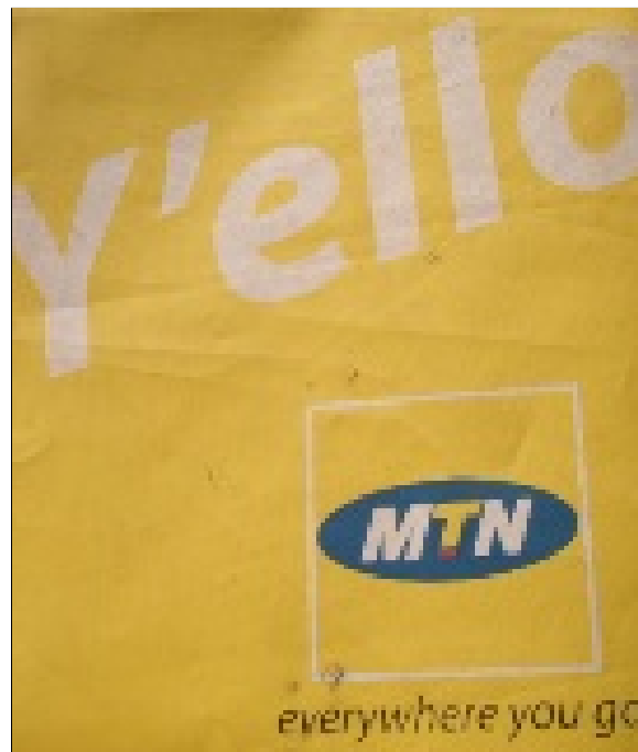
Figure 1. MTN Y'ello Signifier.

Yellow has come to be identified with MTN advertisements to such an extent that it has become a dominant signifier in the MTN world. At the connotative level of meaning, the use of the colour could be tied to any of the following representations, as put forward by the Glidden paint company: 'Yellow is truly joyous and virtuous in its purest form. Yellow exudes warmth, inspiration and vitality, and is the happiest of all colours. Yellow signifies communication, enlightenment, sunlight and spirituality.' 3 While all of these interpretations seem to fit into the telecom world, there are, however, yet other shades of meaning which coincide with the above interpretations or further extend them within the context of use.