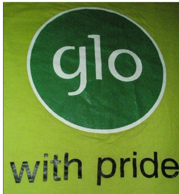
Figure 3. Globacom's Lemon-green colour.

This scene could remind one of the Biblical account recorded in Exodus 7: 19 where Moses performed the miracle of turning the waters of Egypt into blood when he was commissioned by God to lead the Israelites out of captivity in Egypt. Rather than producing a negative effect as in the Biblical account, the spilling of the yellow paint into the river in the present discourse has positive connotations. The scene is suggestive of the spontaneity and the vastness of MTN network. All together, the two major codes of the MTN “y’ello magic” seem to bring to the fore the infectious attribute of the MTN network which objects, people and natural phenomena cannot resist but must respond to with a ‘chameleonic’ instinct.