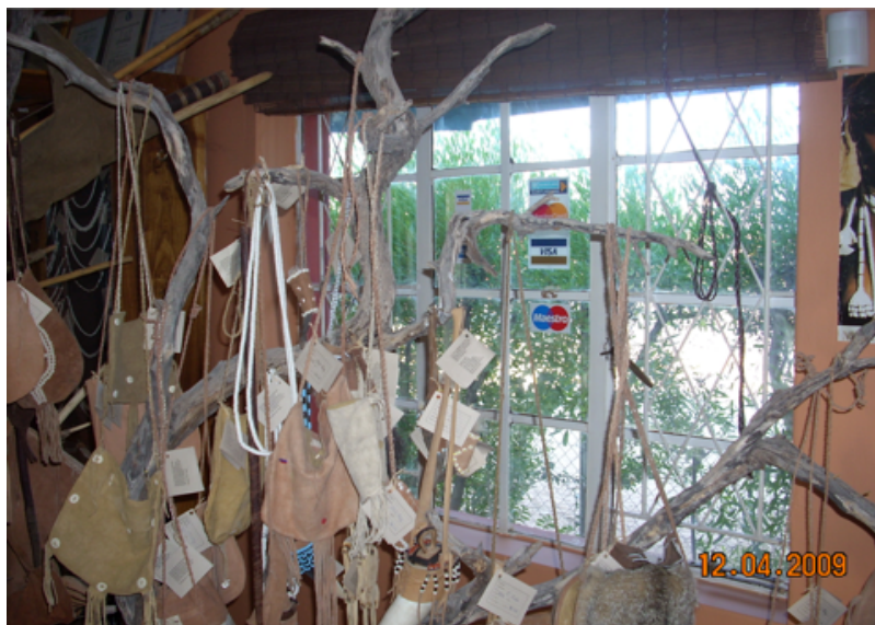
Figure 6. Interior of Gantsi Craft, Ghanzi, Botswana

Figure 6 shows San work on sale for tourists in Ghanzi, Botswana. As evident from the credit card icons on the windows, the level of prices charged for the handiwork is high, even by Western standards. The idealised suggestion inherent in the collection is that the ostrich shell necklaces, leather pouches, etc. are authentic items, still used by the San today. In fact they are used and worn only for tourist gratification, as graphically shown in the over-aestheticised (and eroticised) commercial image in Figure 7.