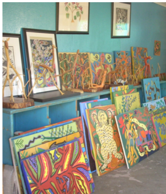
Figure 9. San art on sale in D'Kar, Botswana