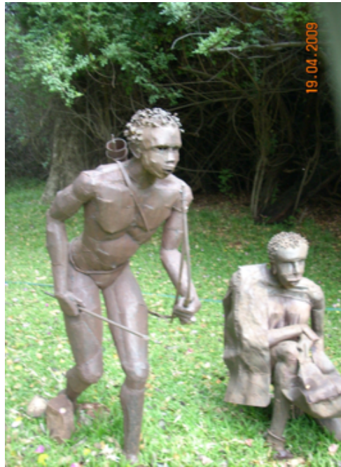
Figure 11. Statues of San hunters, Safari Lodge, Kasane, Botswana.

These statues are an example of idealisation in the sense that it is exactly this image of the San that tourists come to Botswana to see (after the animals) and, as such, the artifice is a tourist text, suggesting to tourists staying at the lodge that the San are not only present but available and looking exactly as they appear in the statue. The image is contrary to the San's modern realities, their general marginalisation and poverty at odds with the sumptuousness of lodges such as this one. The hunting depicted in the San's pose is given the lie through the postcolonial appropriation of their traditional lands for tourism and the associated big-game hunting which brought about their disenfranchisement; lodges are issued annual licenses for a quota of kills of specific species. Sculpture's heyday in the 1880s cast the "noble savage" in bronze as a timeless memorial in the same manner as the heroic dead of past wars were immortalised. This statue, although modern, certainly epitomises the genre. The immutable and frozen sculpture, assert the curators of a 1987 exhibition, is "a container that holds its subject sealed off, separated from the world like a photograph in which everything must be enclosed in a square piece of article" (Barrett, 1996, p. 139). This calls up again the first type of photography discussed in the previous section, where "subject as object" is evident.