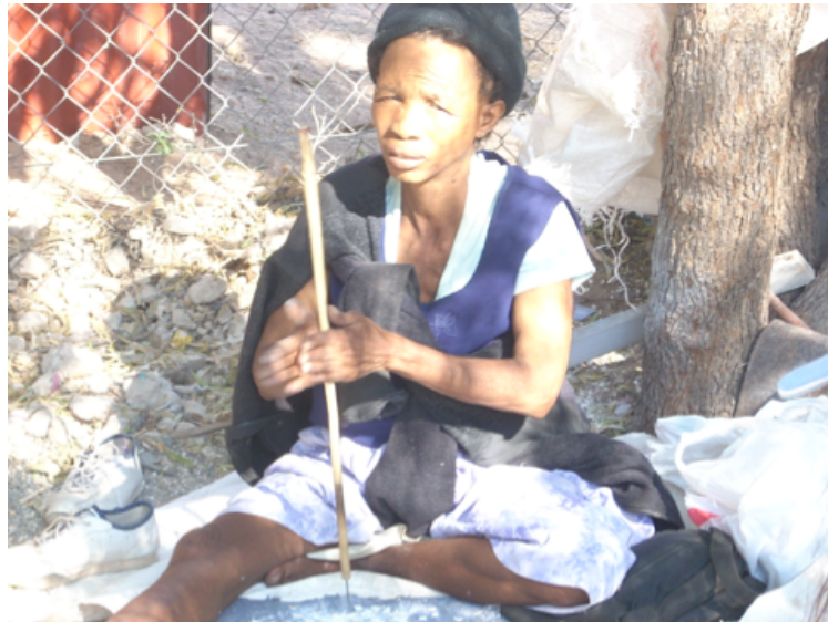
Figure 2. San woman making beads from ostrich egg-shells, Ghanzi.

of the discriminated back upon the eye of power” (Bhabha 1994, pp.107-108). While the woman is emphatically not discriminated against by me as photographer, I know her to be a member of a group which continues to experience debasement in the region. Although I had no desire to exploit it, I acknowledge my position of economic and social advantage over her. As a result, the dynamic of my brief encounter with this woman and the taking of the photograph certainly disturbed me.