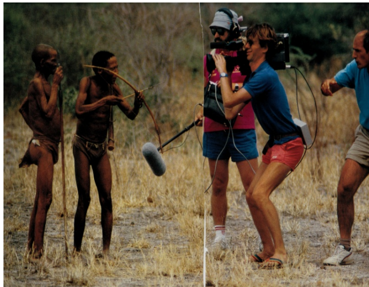
Figure 1. French television crew filming the San, Central Kalahari Game Reserve, Botswana.

The tourist experience is also reflected in photography produced in brochures and magazines by government and industry. Photographs and other visuals such as those in Figure 1 are patently attempting to create an impression of authenticity for tourists and can be analysed in the light of San representations as either “doomed race” or as “children”.