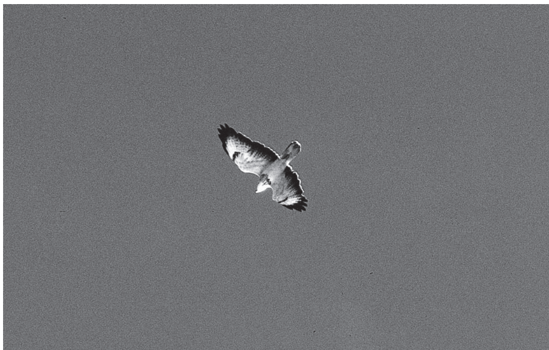
Figure 2. A Common Buzzard Buteo buteo belonging to the category "white". This bird is an adult individual. En ormråk tillhörande den vita kategorin. Denna fågel är en adult individ.

cantly higher among Common Buzzards wintering in Scania (8% of adults, n=160 and 10% of juveniles, n=42 ) compared to the migrants at Falsterbo in the preceding autumn ( \chi^2 = 17 , df=1 , P<0.001 , n=6584 ; Kjellén 1994) it is clear that more local birds are found among the wintering birds. The same study revealed a significantly higher proportion of adults among winter buzzards in Scania (80%) compared to the autumn figures at Falsterbo (60%) ( \chi^2 = 112 , df=1 , P<0.001 , n=15\ 147 ). That juveniles generally migrate further than adults is also demonstrated by Danish recoveries, with an average distance of 216 and 160 km from the ringing site of recovered juveniles and adults, respectively (Nielsen 1977). Most breeding adults in Denmark are considered to be residents, while one third of the younger birds leave the country in winter (Jørgensen 1989). Sylvé (1978) showed that Common Buzzards defend individual winter territories in Scania. Most likely many of the resident adults spend the winter in the breeding territory. Old birds are presumably dominant over juveniles, which are forced to leave the natal area in autumn. They then have to winter in peripheral and less favourable areas in Scania or migrate south. Significantly more juveniles (36%, n = 136 )