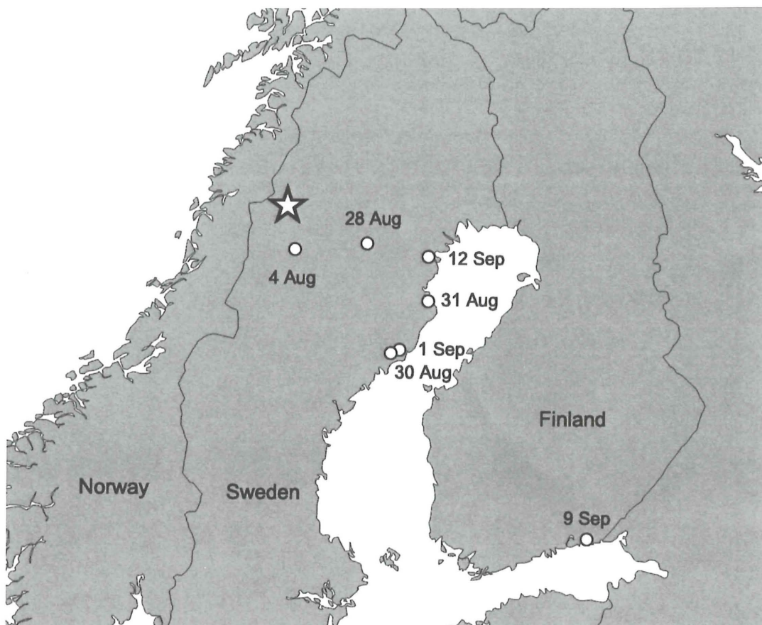
Figure 2. Recoveries (circles) of juvenile Bluethroats ringed in Ammarnäs (star) and recovered during their first autumn migration (recovery date is shown for each recovery). The bird recovered in Finland was ringed as a juvenile, but recovered as an adult two years later. One bird was ringed as a juvenile near the coast (30 Aug) and recovered in Ammarnäs as a breeding bird the following year.

Återfynd (cirklar) av unga blåhakar ringmärkta i Ammarnäs (stjärnan) och återfunna samma höst (återfyndsdatum visas för respektive fynd). Fågeln i Finland återfanns dock som adult, två år efter märkningen som ungfågel, och en fågel (30 Aug) ringmärktes som ungfågel vid kusten och återfanns som häckande fågel i Ammarnäs påföljande år.