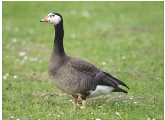
4b: Individual A, 5 June 2007