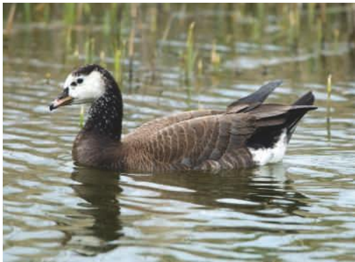
4c: Individual D, 27 May 2006