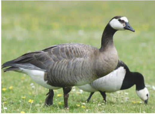
5a: 8 July 2006