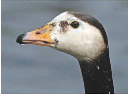
3a: Individual A, 3 June 2007