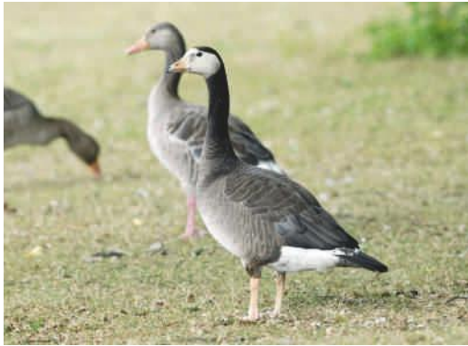
4a: Individual A, 8 July 2006