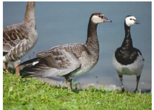
2b: Early September 2004