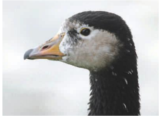
3b: Individual A, 11 October 2006