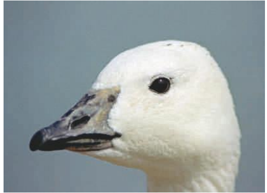
1b: July 2002