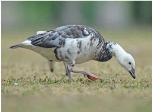
1c: 21 July 2006