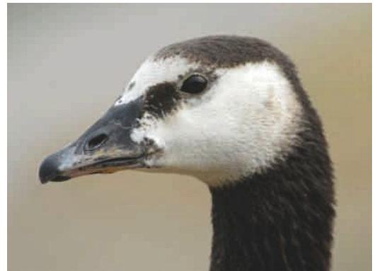
3i: Individual E, 21 July 2006

immature birds. The exact breeding site or mating of the two birds could thus not be observed. Two of the immature birds were similar to those three in 2004 and relatively large (Figure 2c) whereas the third one was paler and in several aspects less developed. From the next observation on, only the two larger immature birds were seen. The nature and fate of the third bird thus remain unknown. In November 2005, a small group comprising all five hybrids, one Barnacle Goose and one Greylag Goose was observed.