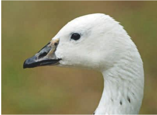
1a: 21 July 2006