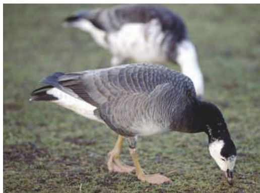
6b: February 2004