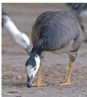
6e: 11 July 2006