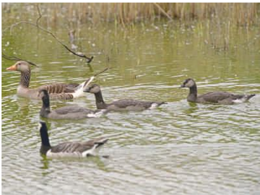
2a: June 2004

In 2004, a Barnacle Goose and a Greylag Goose were seen together with three immature birds which seemed to be hybrids (Figure 2a). Both parent birds appeared to be typical for their respective species. In the spring 2005, the parent birds were sought for without success until they turned up with three new