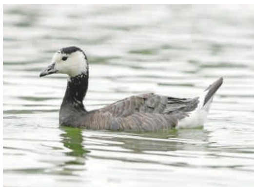
6c: 21 July 2006