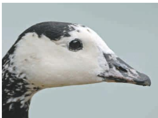
6d: 21 July 2006