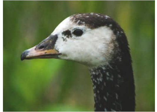
3g: Individual D, 27 May 2006