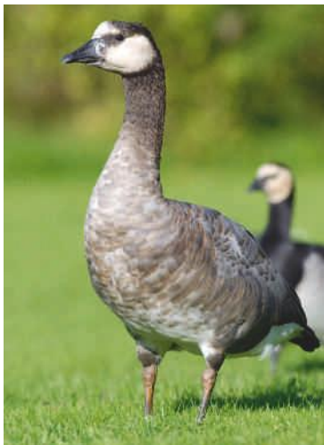
5e: 1 October 2006