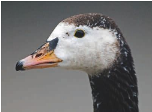
3c: Individual B, 13 July 2007