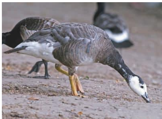
6a: 11 July 2006