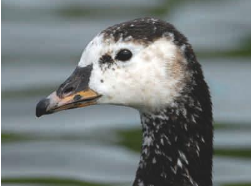
3f: Individual D, 3 June 2007