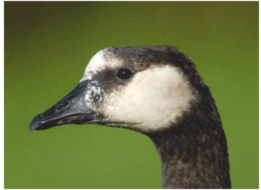
5d: 1 October 2006