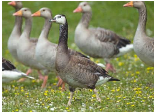
4d: Individual D, 24 June 2006