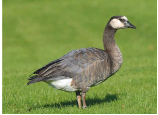
5b: 1 October 2006