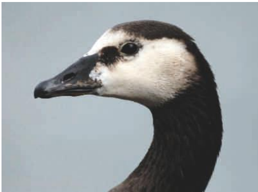
3h: Individual E, 13 July 2007