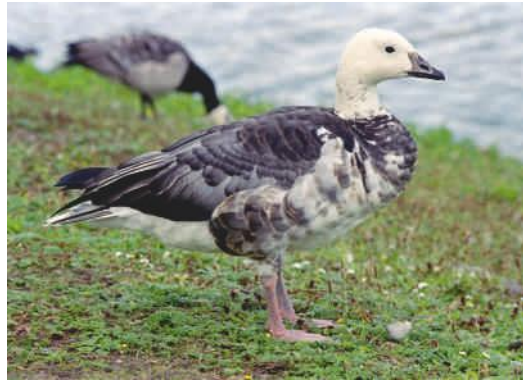
1d: July 2002