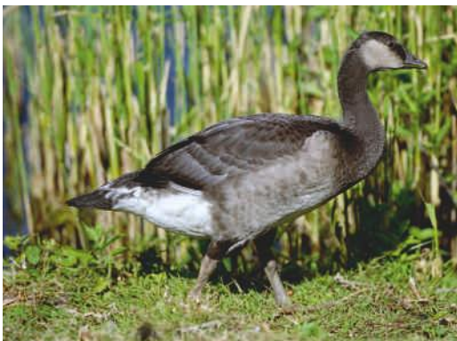
2c: June 2005

Figure 2. Barnacle Goose x Greylag Goose. The pair with their brood in June 2004 (2a) and with one of the young in September 2004 (2b). One of the young of the brood from 2005 in June 2005 (2c).