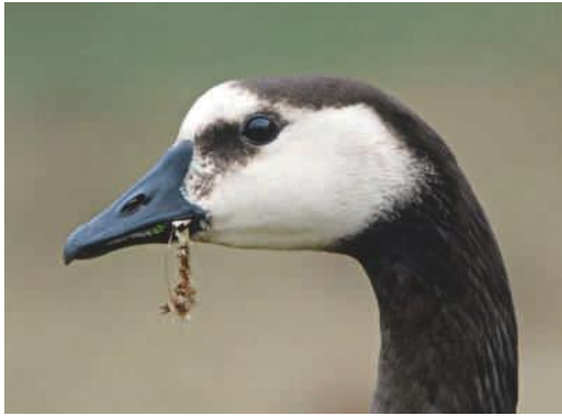
5c: 8 July 2006