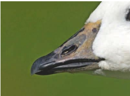
1e: 5 September 2007

Figure 1. Barnacle Goose x Snow Goose. The same bird in all photos. White head and neck and greyish-yellow bill with dark areas, a round dot near the basis, and a conspicuous "grinning patch". The clearer colour of the bill in photo e is due to sunlight. Breast mainly dark within an area corresponding to the dark breast in Barnacle Geese and flanks largely white (c). The flanks had more dark patches 5–6 years earlier (d).