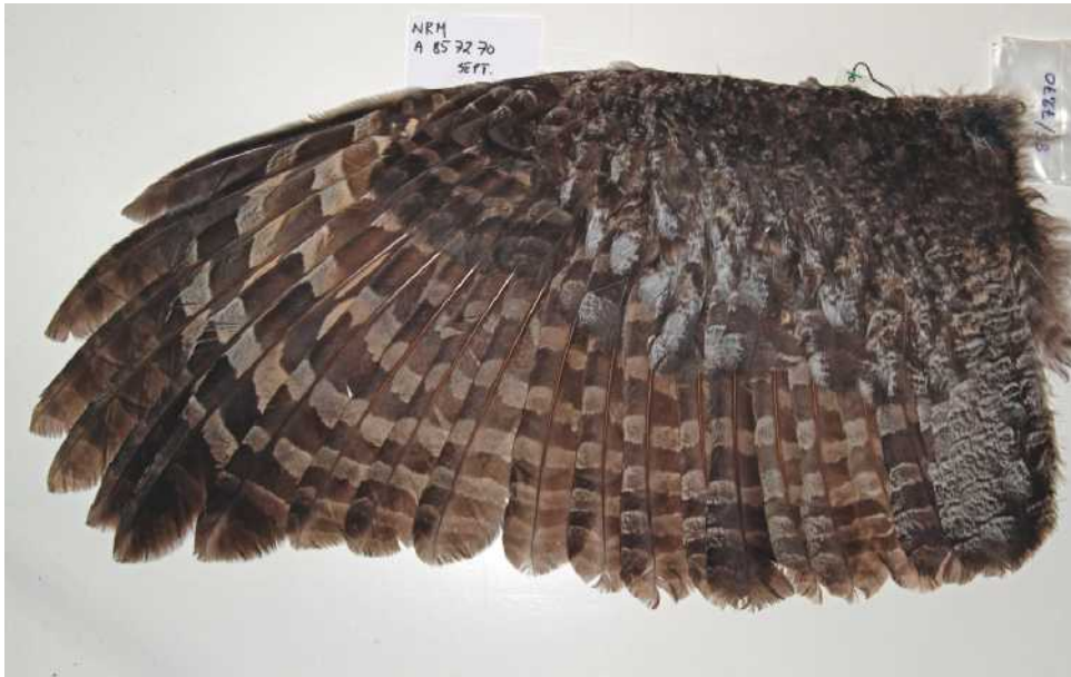
Figure 2. Typical wing pattern of a Great Grey Owl (specimen 85/7270) in stage M1, age 2C autumn. This bird has moulted the three primaries P4–P6, the innermost secondaries S9–S11, and S5.

Karakteristisk mytemønster hos lappugle i stadium M1 (alder 2Khøst). Fuglen har mytt håndsvingfjærene P4–P6, og armsvingfjærene S9–S11, samt S5.