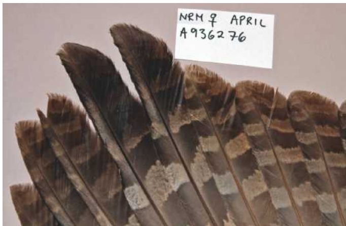
Figure 1. Detail of primaries on specimen 93/6276 from April 1993, showing distinct differences between juvenile and adult flight feathers (P5 and P6). Juvenile feathers are recognized by narrow, often unregular, terminal bands.

A total of 23 owls were ringed, either as pullus (13 ind.), as adults 2K+ (8) or with unknown data for time of ringing (2). Since the birds ringed as pullus can be categorized exactly at time of death, these birds have functioned as a blueprint for the moult pattern study. At time of death, the birds ringed as pullus were in age classes Juvenile (2), M2 (4) and older (7). No ringed birds were thus found in the M1 category. However, as the birds with the highest number of unmoulted juvenile feathers are found here, there is very little risk of