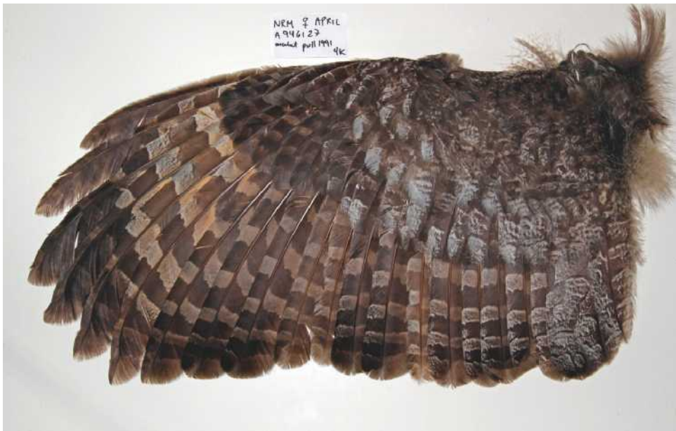
Figure 3. Typical wing pattern of a Great Grey Owl (specimen 94/6127) in stage M2, from April (age 4C spring). P2–P4, P7 and P8 were moulted last summer, P5 and P6 were moulted one year earlier, while P1, P9 and P10 are still juvenile, unmoulted feathers. For further explanation on the secondaries' pattern, see Appendix 3.

Karakteristisk mytemønster hos lappugle i stadium M1 (alder 2Khøst). Fuglen har mytt håndsvingfjærene P4–P6, og armsvingfjærene S9–S11, samt S5.