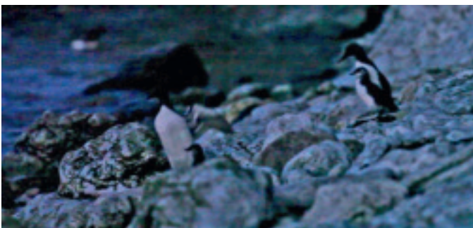
The breeding ledges 10 and 30 meters above the sea shore, and a young taking the leap and walking with a parent to the water. Häckningshyllorna 10 och 30 meter över stranden samt en unge som just hoppar och sedan följer en förälder till vattnet.