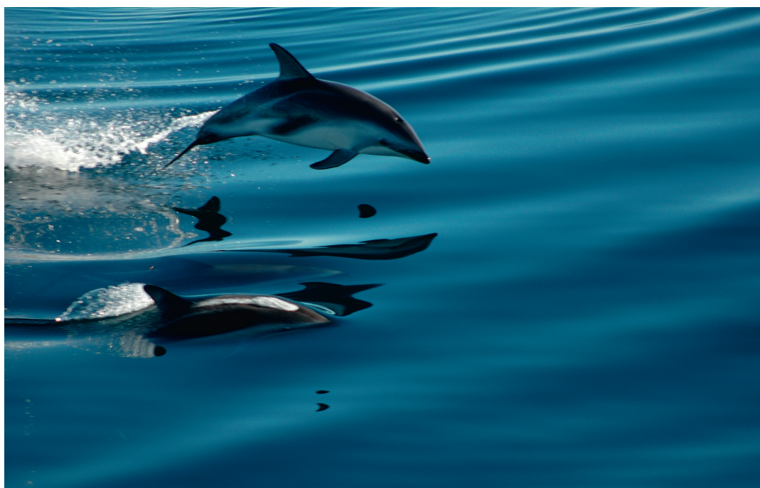
Figure 1. Great Shearwater Puffinus gravis and Dusky Dolphin Lagenorhynchus obscurus , the most abundant bird and cetacean species. Note the extremely calm sea.

Större lira Puffinus gravis och sydlig vitsiding Lagenorhynchus obscurus, den vanligaste fågeln och valen. Notera det spegelblanka havet.