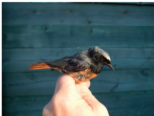
Figure 2. The hybrid male in the hand. Notice the white feathers on central forehead, absence of white margins on outer webs of tertials and secondaries and the extent of black on throat and upper belly, details more or less intermediate between the two Redstart species, but resemble those found in some eastern subspecies of Black Redstart.

Hybridhanen i handen. Notera vita fjädrar i pannan, avsaknad av vita ytterkanter på tertialer och armpennor samt utbredningen av det svarta på strupe och bröst, detaljer som uppvisar mer eller mindre intermediära drag för de båda rödstjärtsarterna, men som påminner om dräkten hos vissa ostliga underarter av svart rödstjärt.