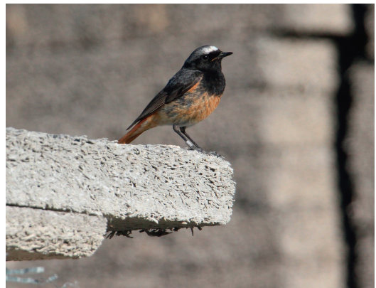
Figure 1. The male hybrid at its breeding site in Österbymo, southeastern Sweden.

The male hybrid strongly resembled a male P. o. phoenicurioides owing to dark grey back and wings, some white feathers on central forehead and a black throat extending downwards ending in a bow across the central part of the breast (Figure 1–3). The black color also extended to a small area under the carpal joint. Some other characters were found to be intermediate between the two redstart species. The bird was safely determined a hybrid by means of the five following characters: (1) Remaining white color on emargination of outer web on innermost tertial; (2) Paler red color on lower breast and underparts; (3) Scattered white feathers on lower belly (behind the legs), rump and under tail coverts; (4) Absence of emargination of outer web on the sixth primary; and (5) Wingtip was made up of primaries 3–5. Due to extensive abrasion of tips of flight feathers, the exact distances