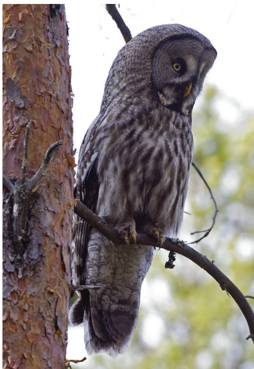
Figure 2. Young, female Great Grey Owl with typical juvenile tail feathers (2CYs). This female was banded as a chick on an artificial breeding platform close to lake Siljan in central Sweden in 2010 and controlled as a breeding bird in Hedmark county, eastern Norway, in 2011.

Of 144 birds, 102 observed in spring had juvenile tail feathers (Figure 2) and these were all 2CY birds from 2011. Another 9 birds were classified as probably belonging to the same age category (Table 3). Only 3 individuals could be aged as 3CY birds, hatched in 2010, while 16 birds were 3CY or older (Figure 3). Two individuals were classified as probably at least 3CY birds. From autumn 2012 there were 10 individuals which were classified as 2CY+, based on their adult tail feathers. Only two