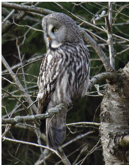
Figure 3. Adult, 3CY+ bird photographed on Tromøya, Aust-Agder county in southern Norway on 14 January 2012. Note the rounded, broad tail feathers with long distance from the outermost dark band to the tip of the feathers.

Adult 3K+ fågel fotograferad på Tromøya, Aust-Agder fylke i Södra Norge 14 januari 2012. Märk de breda, avrundade stjärtfjädrarna med stort avstånd från det yttre, mörka tvärbandet till fjädrarnas ytterkant.