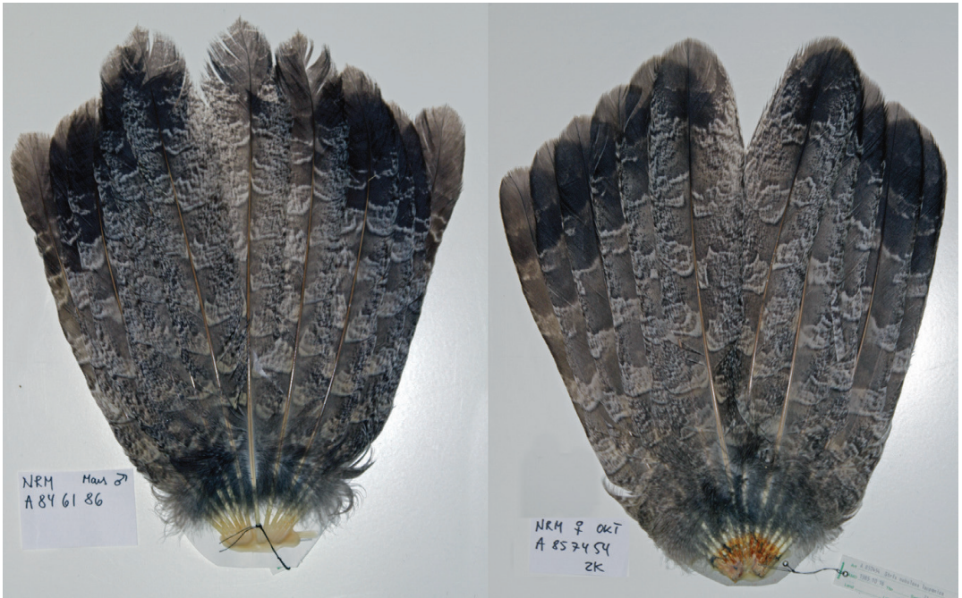
Figure 1. Tail of young Great Grey Owl in age category 1CY–2CYs (left), showing typical juvenile feathers, compared to a tail of a bird that has moulted once (2CYa; right). The juvenile feathers are sharply pointed with a diffuse, dark crossbar close to the whitish edge. The adult tailfeathers are broader with rounded tips, and no diffuse crossbars between the outer distinctive dark crossbar and the tip of the tailfeathers. See also Figure 2 and 3. Specimens photographed in the Natural History Museum, Stockholm.

Stjärt av ung lappuggla (vänster) med juvenila fjädrar, sammanliknat med stjärt från en uggla som har ruggat första gången. Juvenila fjädrar är spetsiga med en ljus yttre kant. Adulta stjärtpennor är bredare, avrundade och utan diffusa mörka band utanför det markanta yttre tvärbandet. Se även Figur 2 och 3.