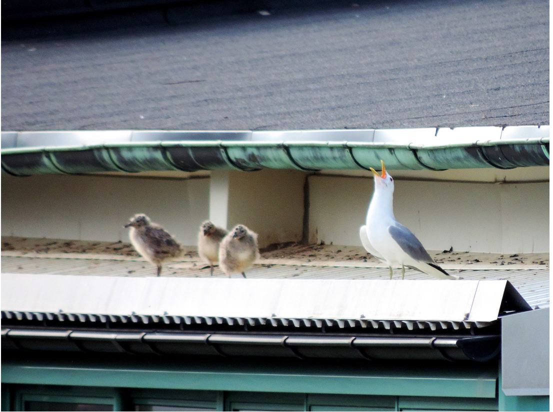
FIGURE 2. Three chicks and one parent of Mew Gull Larus canus at Nest 1 (see Figure 1) on the roof of a balcony of one of the buildings.

— Tre fiskmåsar Larus canus och en förälder vid bo 1 (se figur 1) på ett balkongtak på en av byggnaderna.