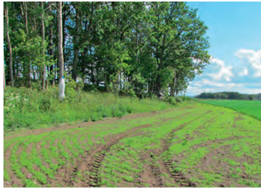
Figure 1. Unsovn strip on field of spring seeds near Husön. A nest (A1) was situated in the vegetation in front of the grove at the left. 20 June 2011, the young are newly fledged.

Furthermore, we were interested in describing the vegetation at nesting and foraging sites. Based