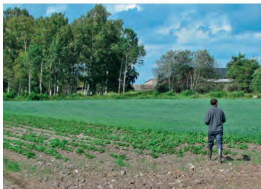
Figure 2. Potato field at Husön, Bärsta, 20 June 2011. Potato containers are stored in the background. Most part of the soil is still uncovered in the potato field. Potatisåker vid Husön, Bärsta, 20 juni 2011. Potatislårar är travade i bakgrunden. Den största delen av marken i potatisfältet är ännu inte täckt av vegetation.

in earlier years, as well as in other parts of central and northern Sweden, a preliminary management plan to improve the Ortolan Bunting population in Sweden has been launched.