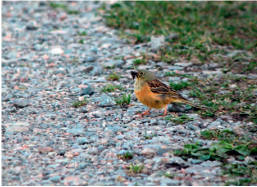
Figure 5. Male Ortolan Bunting (A1) with food for youngsters on the road from Husön to Sörön. Observations such as this have been used as confirmation of a successful breeding nearby. 12 June 2011.

Hanne av ortolansparv (A1) med föda till ungarna på vägen mellan Husön och Sörön. Denna observation är en bekräftelse på att fågeln häckar i närheten.