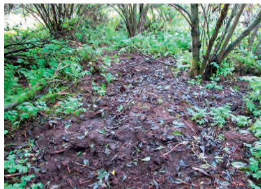
Figure 3. Forest ground at southwestern part of Restamossen (males B4-B6 singing places). The peat soil is partly open underneath the birches and elder bushes. 27 August 2011.

The actual study area, ca 150 ha in size, was defined in April 2011 before the Ortolan Buntings arrived. Most of the groves in the area were thinned in 2009/2010 and three of the landowners were asked to leave 1.5 ha unsown around these groves (Figure 1). When the Ortolan Buntings arrived in late April–early May most of the ground within the survey area was devoid of vegetation. Sowing was under way and in the middle of May most fields within the area started to turn green. This was however not the case for the fields intended for potato-tops or carrots, covering some 20% of the area. The potato plants did not fully cover the soil until the beginning of July (Figure 2). Furthermore along the southern part of Restamossen (NE part of the study area) the vegetation is rather unique. The forest roof is exploited by high birches growing fairly sparsely. The undergrowth is however rather thick and consists mainly of red-berried elder Sambucus racemosa . The bushes are fairly dense and under the bushes the ground is partly bare and consists of organic soil (Figure 3).