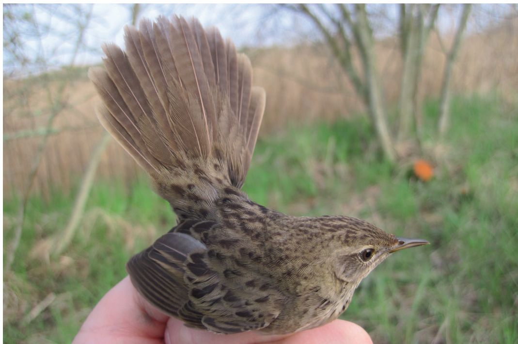
Figure 1. A grasshopper warbler showing the tail with growth bars on the feathers. The tail is moulted during the stay in Africa. The width of one growth bar (one light band grown during night and one dark band during day) represents the growth during 24 hours. Wide growth bars are assumed to be associated with good nutritional status.

En gräshoppsångare demonstrerar stjärten med tillväxtzoner på fjädrarna. Stjärten ruggas under vistelsen i Afrika. Bredden hos en tillväxtzon (ett ljus band under natten och ett mörkt band under dagen) motsvarar tillväxten under 24 timmar. Stor zombredd anses indikera god näringsstatus.