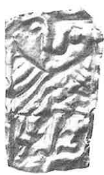
Fig. 12. A double gubber, on which both have the same gender as indicated by the dress [C-IV-1]