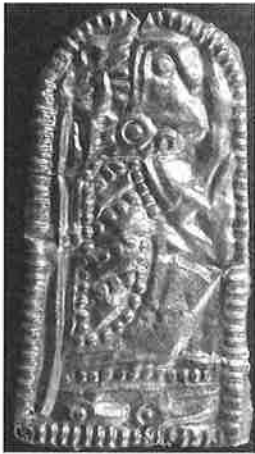
Fig. 7. A woman with a horn in front of her face. She is wearing a richly decorated cape and a complicated Irish ribbon knot. [B-I-1]

Category [B] is made up of women. They have all rather long hair, at least longer than shoulder length, but sometimes even floor length. They usually wear an Irish ribbon knot (with one exception, where the woman is wearing a hat). The dress is long and is sometimes combined with an apron and a cape. The feet are visible but very seldom the ankles. The attributes are: horn, fibula, ornamented cape, and necklace.