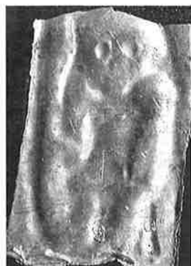
Fig. 19. A wraith bearing a staff. [D-VII-1]