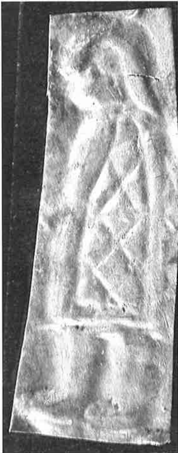
Fig. 31. A man without gestures [A-V-2] who could stand for a recently deceased man – husband, father, brother or son.

A guldgubbe from subcategory [A-V] (Fig. 31) could be taken for a recently deceased man – husband, father, brother or son. The guldgubber from that subcategory depict men who make no gestures and do not interact with anyone. The memory of the dead person is more vivid than that of the ones who died several years ago. A gubbe from subcategory [B-II] (Fig. 32) could be used for the same reason, depicting only a woman – wife, mother, sister or daughter. They could both be placed on the post on the same occasion as mentioned above or during a feast or burial ceremony.