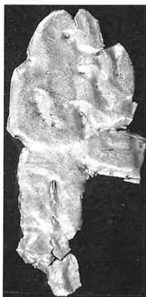
Fig. 16. A wraith holding its hand in front of his mouth. [D-IV-2]

There are seven divisions of the category [D]. In the first [D-I] all wraiths have their arms and legs with feet pointing downward (Fig. 13). In subcategory [D-II] they touch their breast (Fig. 14). Subcategory [D-III] contains guldgubber where the anthropomorphic being is folding its arms (Fig. 15). Subcategory [D-IV] shows guldgubber where the being is holding its hand up to its mouth (Fig. 16). In category [D-V] all of the beings shown have no or cut arms (Fig. 17). Subcategory [D-VI] consists of guldgubber where the being has raised arms (Fig. 18). The last category [D-VII] shows staff bearing wraiths (Fig. 19).