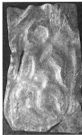
Fig. 23. A guldgubbe with visible outlines but enigmatic imprint [F-II-3]

Category [E] is made up of animals and has no subcategories. There are at present 12 imprints of animals (all found in Sorte Muld so far) and not all of them can be categorized. There are bears, pigs and probably a kind of deer (Fig. 20-21).