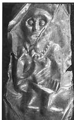
Fig. 14. A wraith holding its hand on its chest. It is wearing a necklace made of beads. [D-II-1]