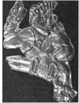
Fig. 5. A man in mid action with a sword in his left hand, his other hand is raised. It is not evident whether the other hand was holding something as well. [A-IV-1]