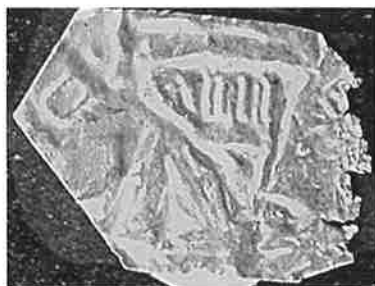
Fig. 20. An animal, probably a kind of red deer. [E-1]

Category [E] is made up of animals and has no subcategories. There are at present 12 imprints of animals (all found in Sorte Muld so far) and not all of them can be categorized. There are bears, pigs and probably a kind of deer (Fig. 20-21).