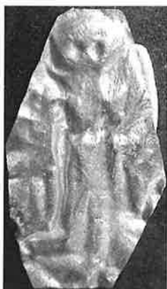
Fig. 13. A wraith with its legs and arms pointing downward. Its palms are facing the observer, its feet point to its right side. [D-I-1]

The next category [D] is called wraiths. Formerly some guldgubber of this group were called dancers (Watt 1992, pp. 213–215), but a closer look at the details of this group makes another explanation more plausible. They have big eyes and seldom any facial distinctions. They are always naked yet nevertheless have no gender specifications. They have exaggerated hands. Attributes of the wraiths are: a staff and in the case of one imprint a necklace. Sometimes a gold collar made of a piece of gold was wrapped around the guldgubbe after stamping.