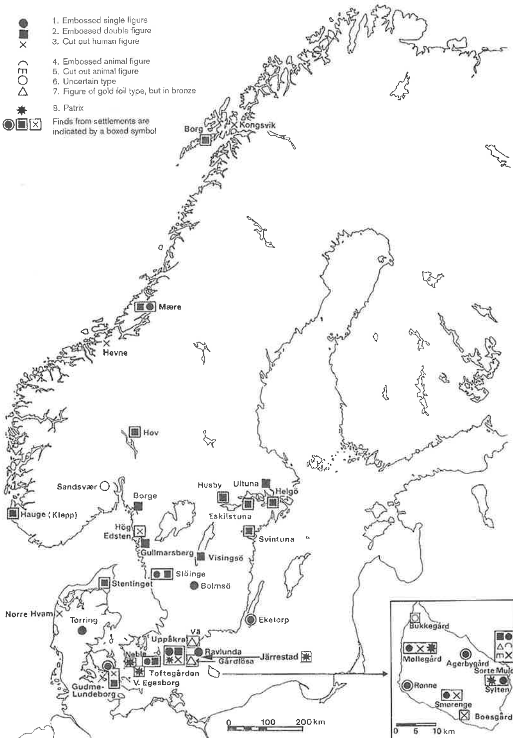
Fig. 1. Distribution of guldgubber in Scandinavia (after Lamm 2004)