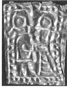
Fig. 9. A double gubber, on which he is standing on the left and she is holding her at her hip. [C-I-4]

Category [C] consists of double gubber. Double gubber always show a pair of people facing each other. Normally a man and a woman make up this pair, but there are exceptions where the gender is obviously the same (but only 3–6 gubber against over 200 double gubber). There are no attributes, except for some as yet unidentified objects.