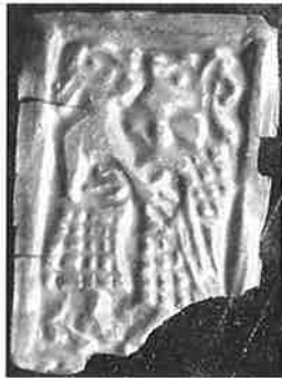
Fig. 11. A double gubber, on which he is standing on the left and she on the right; they are both holding each other. [C-III-1]

The three subcategories are: [C-I], the man grasping the woman around the waist or hip (Fig. 9), [C-II], the woman grasping the man's wrist (Fig. 10), and [C-III], the pair holding each other (Fig. 11). The guldgubber with the same gender belong to [C-IV] (see Fig. 12).