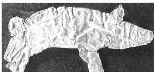
Fig. 21. An animal, probably a pig. [E-3]