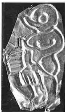
Fig. 15. A wraith grasping its right arm with its left hand. [D-III-1]

There are seven divisions of the category [D]. In the first [D-I] all wraiths have their arms and legs with feet pointing downward (Fig. 13). In subcategory [D-II] they touch their breast (Fig. 14). Subcategory [D-III] contains guldgubber where the anthropomorphic being is folding its arms (Fig. 15). Subcategory [D-IV] shows guldgubber where the being is holding its hand up to its mouth (Fig. 16). In category [D-V] all of the beings shown have no or cut arms (Fig. 17). Subcategory [D-VI] consists of guldgubber where the being has raised arms (Fig. 18). The last category [D-VII] shows staff bearing wraiths (Fig. 19).