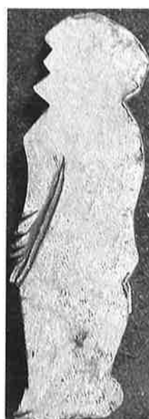
Fig. 17. A cut-out guldgubbe showing a rather stylized arm and hand. [D-V-1]