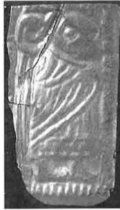
Fig. 32. A woman without gestures [B-II-7] who could stand for a recently deceased woman – wife, mother, sister or daughter.