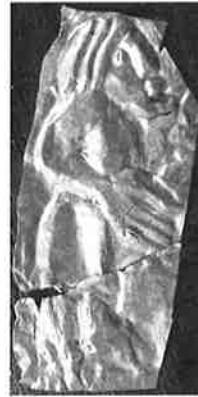
Fig. 4. A man with a gesture, herewith one hand outstretched, the other is not visible [A-III-3]