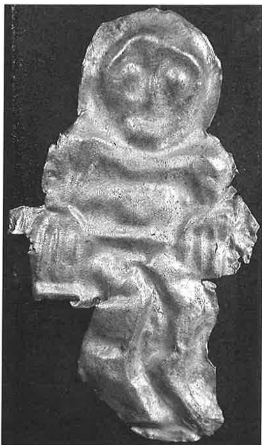
Fig. 30. A wraith [D-I-6] which could represent a dead person or an ancestor.

A guldgubbe from subcategory [D-I] (Fig. 30) could be taken and placed on a post for display. The person on the guldgubbe could represent an ancestor who had died quite a while ago and therefore is depicted in a more ghostlike style. It might have been the day that person died or a special holiday on which all people remembered their ancestors or the people who had died. They placed the gubbe on the post and probably made a kind of wish