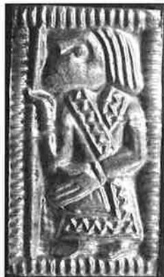
Fig. 3. A man with a staff dressed in a kaftan [A-II-2]