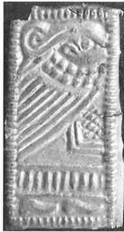
Fig. 8. A woman with a two-row bead necklace; her arms are not visible and she is not displaying any gestures. [B-II-2]

This category has two subcategories: [B-I] which comprises all women with a horn (Fig. 7) and [B-II] consisting of women without a horn but with necklace, fibula or cape (Fig. 8).