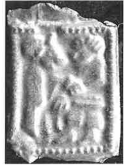
Fig. 10. A double gubber, on which she is standing on the left and he is grasping her arm. [C-II-1]

The three subcategories are: [C-I], the man grasping the woman around the waist or hip (Fig. 9), [C-II], the woman grasping the man's wrist (Fig. 10), and [C-III], the pair holding each other (Fig. 11). The guldgubber with the same gender belong to [C-IV] (see Fig. 12).