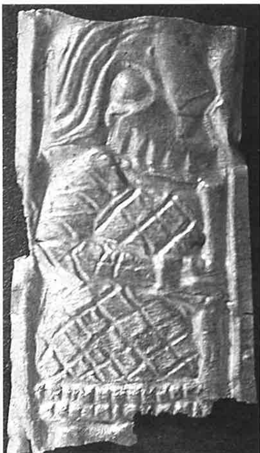
Fig. 27. A staff-bearing man with a beard. He could probably symbolize a wise man or a shaman. [A-II-6]

or shaman, seeing the staff as a magic wand (Price 2002). So a wish made with this gubbe could mean a wish for a wise judgement, wise or good guidance or advice, and probably the wish for help (magical or not). A possible function and symbolic meaning can be found for every category or subcategory of the guldgubber.