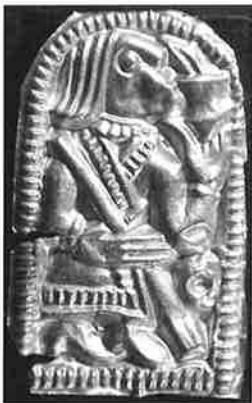
Fig. 2. A man with a Franconian Sturzbecher [A-I-1]

Category [A] consists of gubber depicting only men. They always have rather short hair up to shoulder length; they very often wear a kaftan, which always leaves the feet and ankles visible. The attributes of men are the Franconian Sturzbecher , staff, ring, and a hitherto unidentified object, looking like a paddle or an ancient wine lifter.