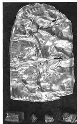
Fig. 25. A formerly folded guldgubbe [F-IV-1]

Category [F] describes all unidentified guldgubbe. It is conceivable that they belonged to one of the categories above when they were made, but some of them are not readable at all. There are four subcategories: [F-I] the third and fourth gender (Fig. 22), [F-II] guldgubber with visible outlines but enigmatic imprint (Fig. 23), [F-III] almost completely faded imprints (Fig. 24), and [F-IV] formerly folded guldgubber (Fig. 25).