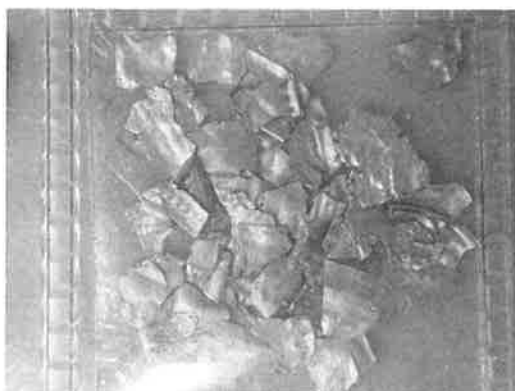
Fig. 26. Fragments of one or more guldgubber [G-137]

Category [G] unites all fragments (Fig. 26) and therefore combines categories and sub-categories of the other six categories.