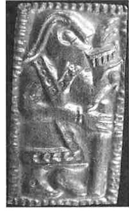
Fig. 33. A man with a Franconian Sturzbecher [A-I-2], possibly symbolizing a wish for a prosperous journey.

Other guldgubber could be used in memory of travellers. A guldgubbe from subcategory [A-I] (Fig. 33), a man with the Sturzbecher , could symbolize a wish for a prosperous journey, as in medieval times drinking completed a contract (the arrha in German laws). Whether the journey was a journey to another country or to an otherworld has to be decided by the reader; both are likely.