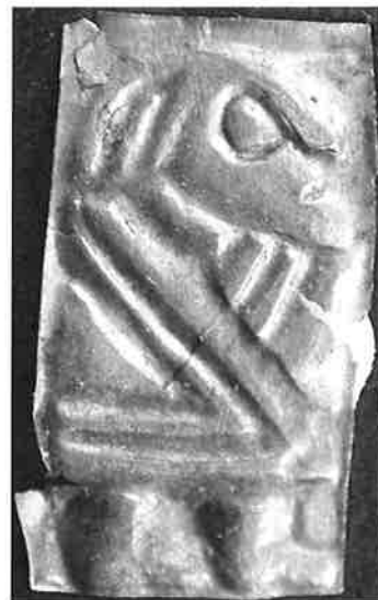
Fig. 6. A man without any gestures; his feet are visible but not his arms. [A-V-5]