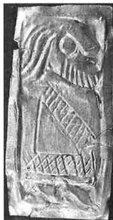
Fig. 22. A guldgubbe displaying a man with a beard and a woman-like dress [F-I-1]