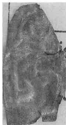
Fig. 24. An almost completely faded guldgubbe [F-III-1]