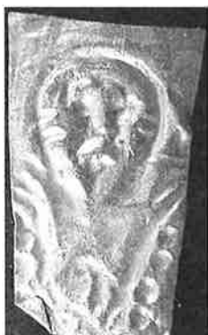
Fig. 18. A guldgubbe displaying a wraith with a big head and its arms pointing upwards. [D-VI-1]