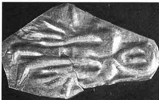
Fig. 29. A wraith [D-I-56] turned through 90° to show the similarity between the gubbe and the dead person on the picture of the Sachsenspiegel .

dead. If one turns the wraiths of subcategory [D-I] (Fig. 29) around, it is quite easy to see the stunning similarity. So this guldgubbe could be used to show that someone died and another person claimed his bequest. The law document (one or possibly a collection of guldgubber) could have been fixed to a post in a big hall for everybody to see. As the society of the Late Iron Age did not have any written documents, it would have been a way to preserve spoken judgements.