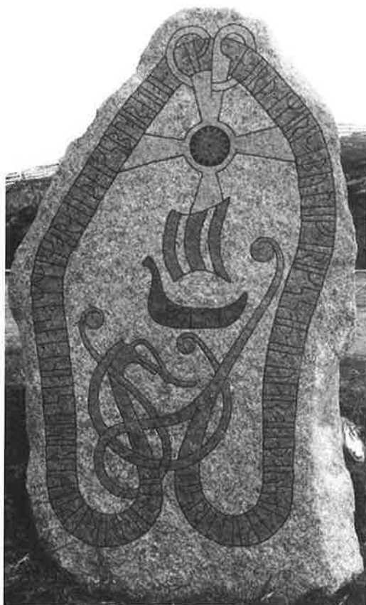
Fig. 4. Rune stone erected in northern Newfoundland in the year 2000 celebrating Leif Erikson's discovery of North America a thousand years ago.

May continued comfort prevail and peace on earth. Kalle carved."