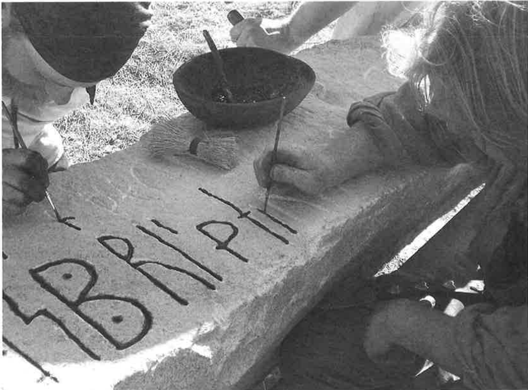
Fig. 5. Copy of the Gimsøy rune stone made by Janne Jonsson Eldskägg.

Juul's rune stones have been carved in connection with Viking markets related to Viking villages or farms such as Foteviken, Borre and Storholmen. In addition to carving rune stones, Juul also does carvings in wood (Harald Juul website) (Fig. 6).