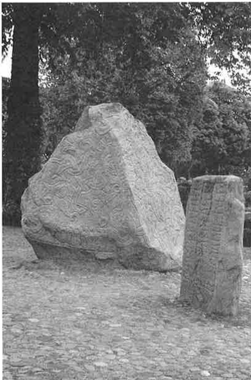
Fig. 1. The Jelling rune stones from the Viking Age. Photo: © Jes Wienberg 2008.

For a long time, people have been aware that messages set in stone last, if not forever, at least for a relatively long time. Nothing in history seems to have changed these conditions. In spite of acid fallout that can make the stone weather, stone still appears to be the best choice of material for a message to reach beyond one's own time. Probably this is the charm of stone carving. Memories set in stone support immortality. Stone carving becomes a way to extend one's own and other individuals' existence in this world. The storage media of our time are not to be compared with stone. Today's documentation is in many cases demagnetized within few years and thereby becomes inaccessible for future generations unless regular updates of information and technology are made.