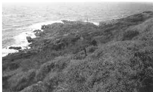
Fig. 3. View from the outermost point at Kullen.

Thus, the landscape itself and the sites in the Kullen district could be a good example of how to theorize about archaeological terminology, and how to break down the dichotomies of Mesolithic and Neolithic and the established polarization of subsistence strategies