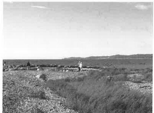
Fig. 5. Looking back at Kullen when walking to the south. (Photo Kristina Jennbert 2005).