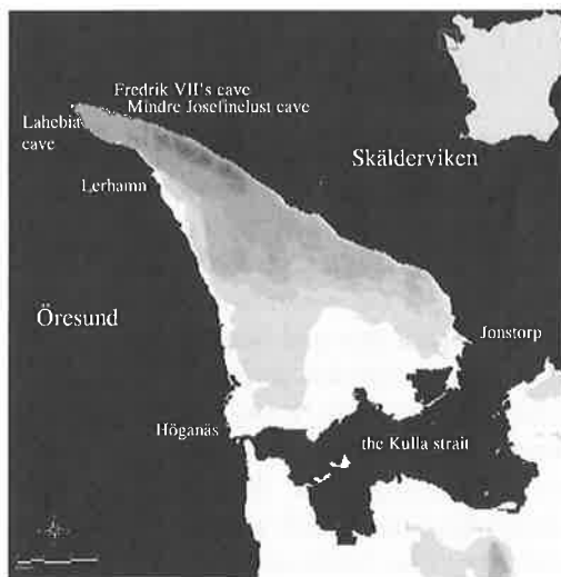
Fig. 1. The post-glacial island with key names mentioned in the text.

Over the millennia the geomorphologic features in the peninsula underwent considerable changes. 1 During the deglaciation around 16,000 BP the marine limit was as high as 85 metres over today's sea level. Kullaberg emerged as a small arctic island in the Kattegatt Sea. In a small fen, a bone of a polar bear was found, first described by Sven Nilsson (1860), and later analysed and radiocarbon-dated to 14,500 BP (Berglund et al. 1992). Due to the land upheaval a larger peninsula was formed 12,000 BP and the shore level was situated 10 metres below the present