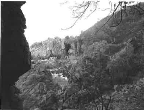
Fig. 4. The view to the east from Fredrik VII's cave to the Josefinelust cave.

It is taken for granted that the caves were used during the Stone Age. However, archaeological excavations in four of them yielded only very few finds from the Stone Age, but more finds from the Iron Age and modern times. The Lahebia cave is situated on the southern side of the outermost point, near today's water level. The cave is rather deep inside a cliff. The opening faces the west. In the summer the sun shines into the cave just a few hours in the late afternoon. A small amount of flint waste and medieval pottery, iron nails and animal bones were found in the Lahebia cave. The cave was mainly used during the Late Iron Age and post-medieval time. In Fredrik VII's cave stone artefacts and animal bones suggest that people could have visited the cave during the Late Mesolithic. Both Fredrik VII's cave and the Mindre Josefinelust cave are exposed towards the inner part of Skälderviken, and turned to small bays surrounded by rocky mountains (fig. 4). In a few hours in the morning the sun reaches the caves. Later in the day they are placed in the shadow of the mountain. The artefacts in the