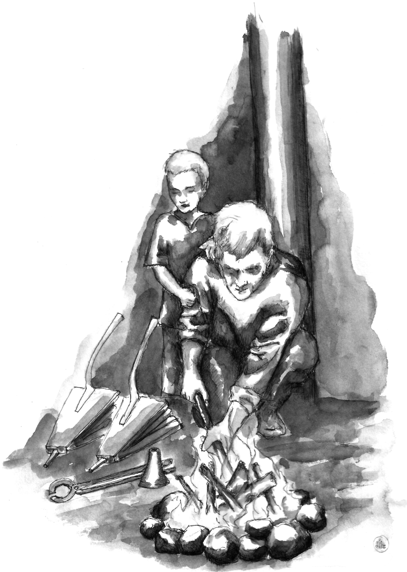
Fig. 4. Multimetalists at work. Drawing by Krister Kåm Tayanin/Gaia Arkeologi.

hearths dug directly into the ground with the aid of only rudimentary or temporary shelters (Svensson forthcoming).