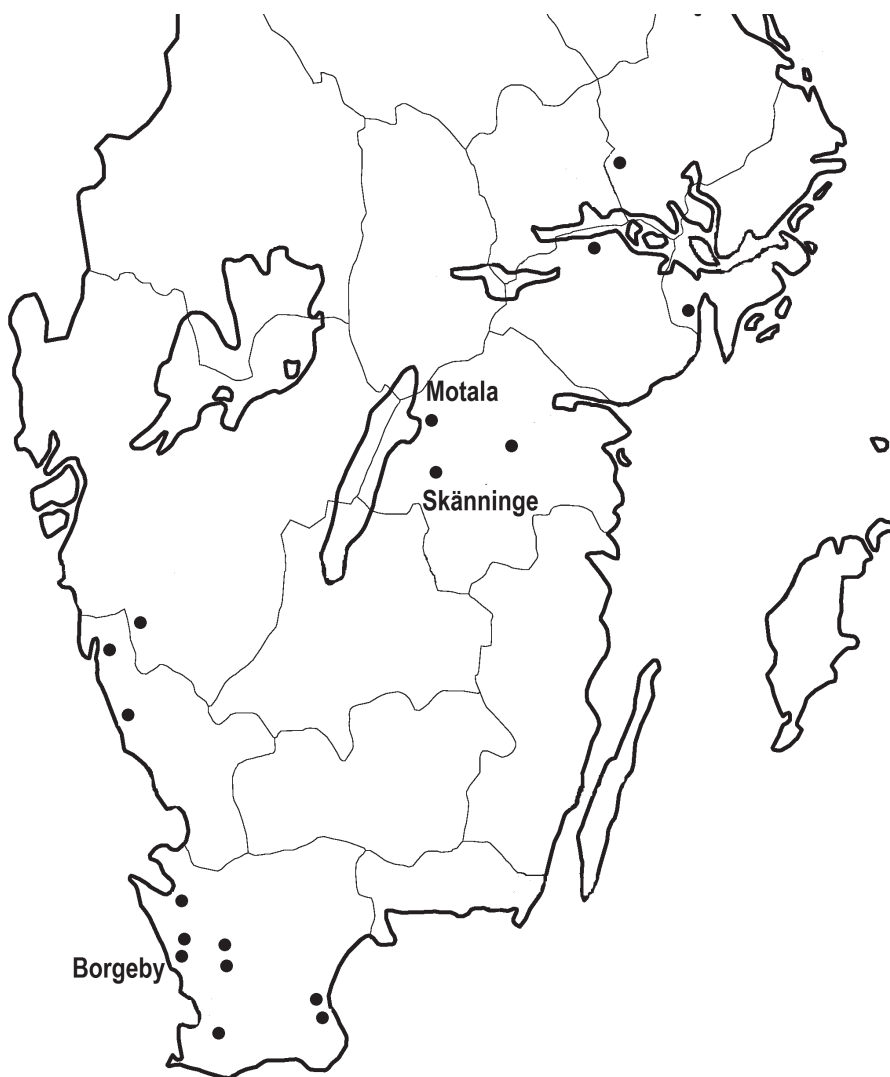
Fig. 1. Overview of southern Sweden showing identified multimetal sites. Each point represents one or up to five sites. Place names of sites discussed in the text indicated. Edited from Lantmäteriets översiktskarta.