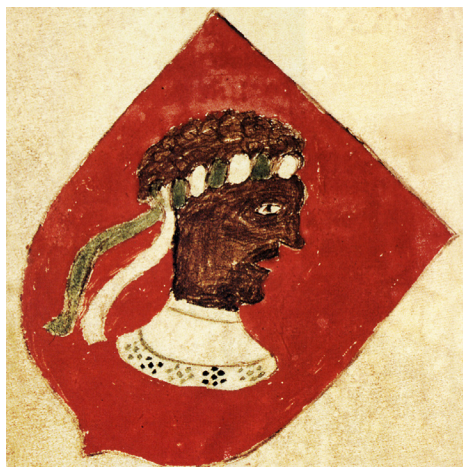
Fig. 12. The earliest depiction of the coat of arms of the Black Heads in Riga, ca. 1441. Pen-and-ink drawing. From Mänd 2005.

Only later on, in the 1880s, some other explanations were offered. For instance, it was assumed that since the members (or at least the elders) of the Great Guild were older and wiser, they were called 'white heads' or 'grey heads,' and consequently, the young men had to be 'black heads.' Another opinion was that their name originated from some kind of headgear, such as a black helmet. 43