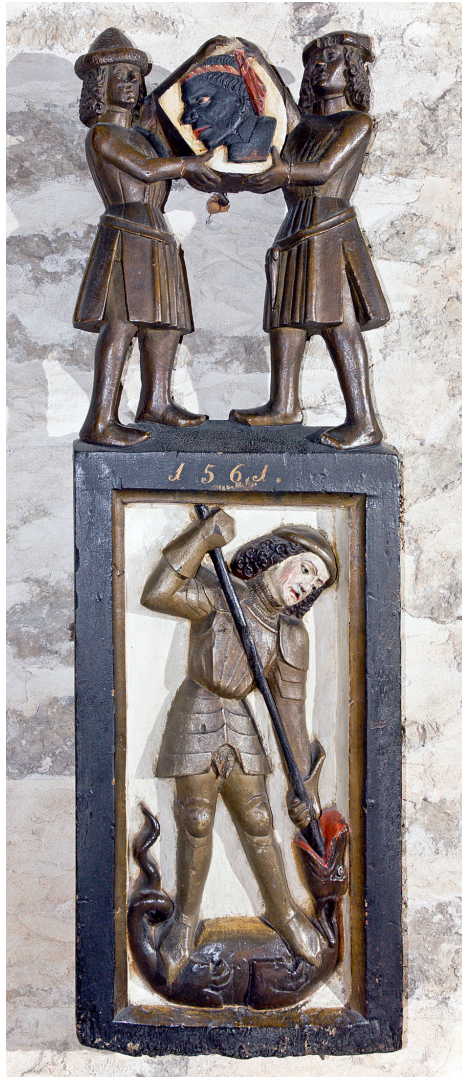
Fig. 9. Bench end with St George and the coat of arms of the Black Heads, ca. 1480, renovated in 1561. Oak, 130 x 42 cm. Tallinn City Museum, Kiek in de Kõk tower.

Unlike the older guilds, such as the St Canute and St Olaf guilds in Tallinn, the Great Guild and the Black Heads did not have a particular patron saint. Instead, they venerated several saints. The Great Guild had two altars in St Nicholas' Church (the first dedicated to Sts Blasius, Victor and George, the second to St Christopher), and two more in St Olaf's Church (that of St Olaf and St Magnus). The Black Heads had two altars in St Catherine's Church of the Dominicans: that of Virgin Mary, St Gertrude and St Dorothy (first mentioned in 1400, consecrated in 1403), and that of the Holy Trinity, St John the Baptist and St Christopher (first mentioned in 1418, consecrated in 1419). 25 On the surviving altarpiece of the Black Heads, which most probably stood on Virgin Mary's altar having arrived from Bruges in 1493, one can see the following saints: the Virgin with St George and St Victor in the central panel, and St Francis and St Gertrude on the wings. In the second view, which depicts the double intercession, Christ and God the Father are accompanied by Virgin Mary and St John the Baptist. 26 A bench end of the confraternity, dating from about 1480, depicts St George slaying the dragon (fig. 9). No images of St Maurice have survived in Tallinn, but according to