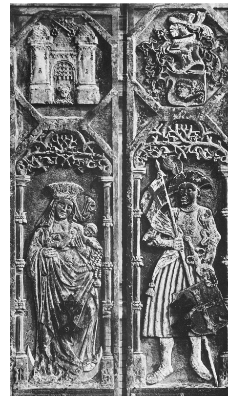
Fig. 11. Side stones with the Virgin Mary and St Maurice, formerly in front of the Black Heads' House in Riga, 1522. Limestone. Cloisters of the Riga Cathedral-Museum.

Let us return to the fact that the cult of St Maurice was not as strong among the Black Heads as that of St George or Virgin Mary. This brings us to the question that has been much debated in the local historiography: did the name of the confraternity really originate from St Maurice? It is interesting that the Black Heads never called themselves the confraternity