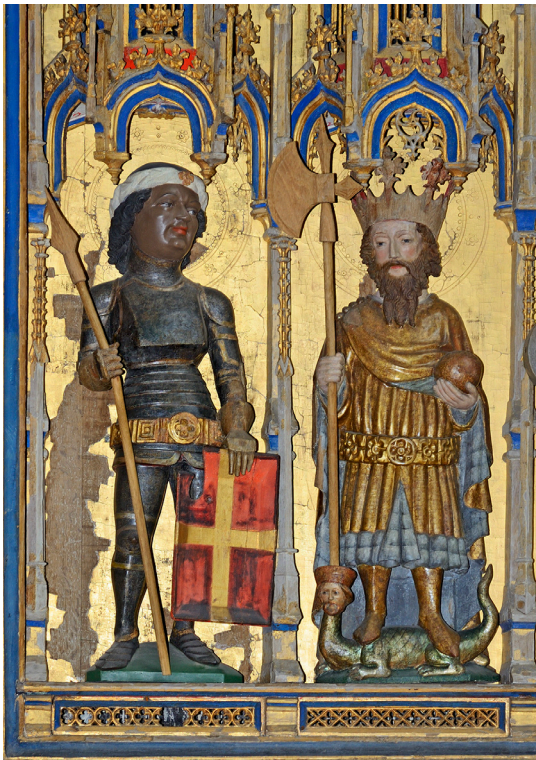
Fig. 5. St Maurice and St Olaf in the wing of the high altarpiece from St George's Church in Wismar, ca. 1430. St Nicholas' Church, Wismar.

In other regions, a compromise was sometimes made: the saint's face was painted dark, but he had no Negroid features. 14 In fact, the next surviving depiction of St Maurice as a black African originates from the Holy Cross Chapel in the Karlstein castle: the painting was completed between 1359 and 1365. Emperor Charles IV had a particular interest in black Africans: the Luxembourg dynasty was believed to have started with Ham, a son of Noah, and according to medieval tradition, the blacks were also descendants of Ham. 15