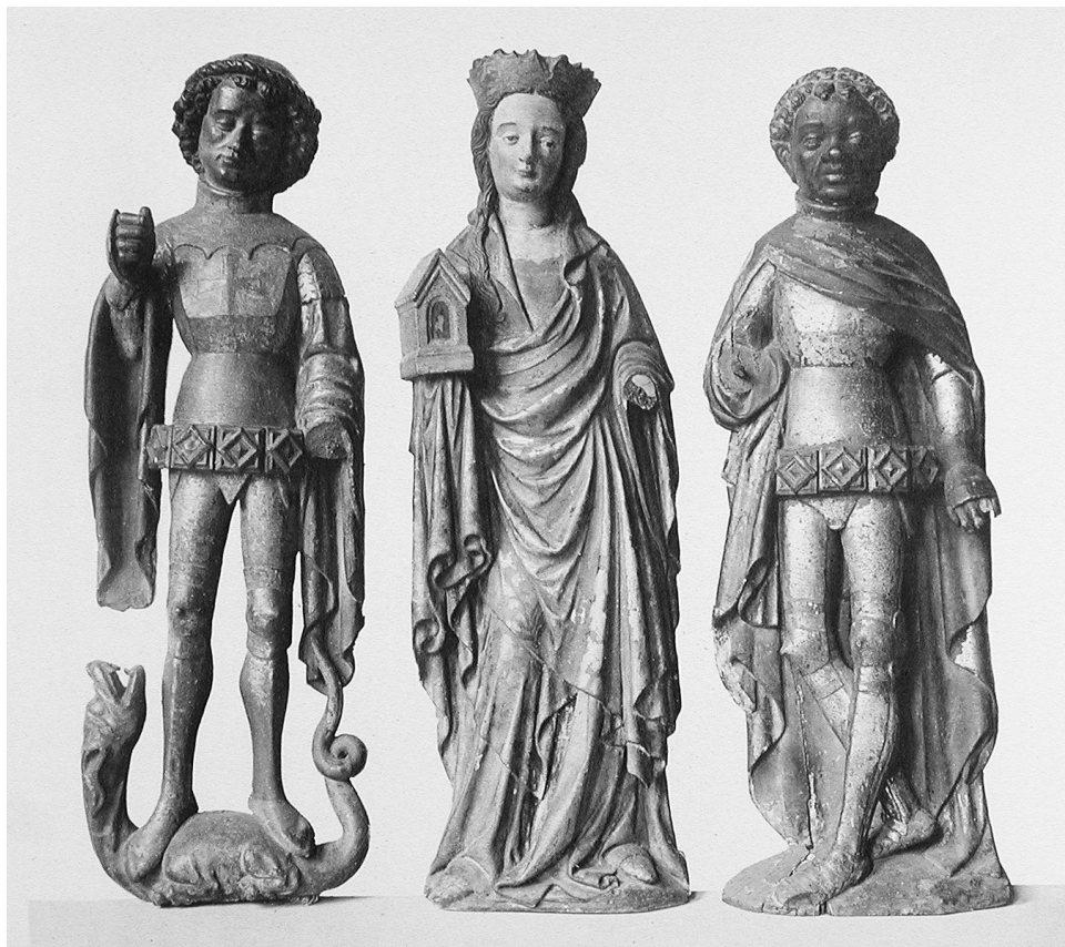
Fig. 10. St George, St Gertrude and St Maurice from an altarpiece of the Black Heads in Riga, ca. 1430–1450. Oak, h. 86,5 cm. From Neumann 1892.

( Beischlagsteine ) from 1522: on one of them the Virgin Mary and the coat of arms of the town are depicted, on the other St Maurice and the coat of arms of the Black Heads (fig. 11). 38 (The house was destroyed in World War II, but rebuilt in the 1990s. The original side stones are nowadays displayed in the cloisters of the Riga Cathedral-Museum.) Both the figure on the side stone relief and the fifteenth-