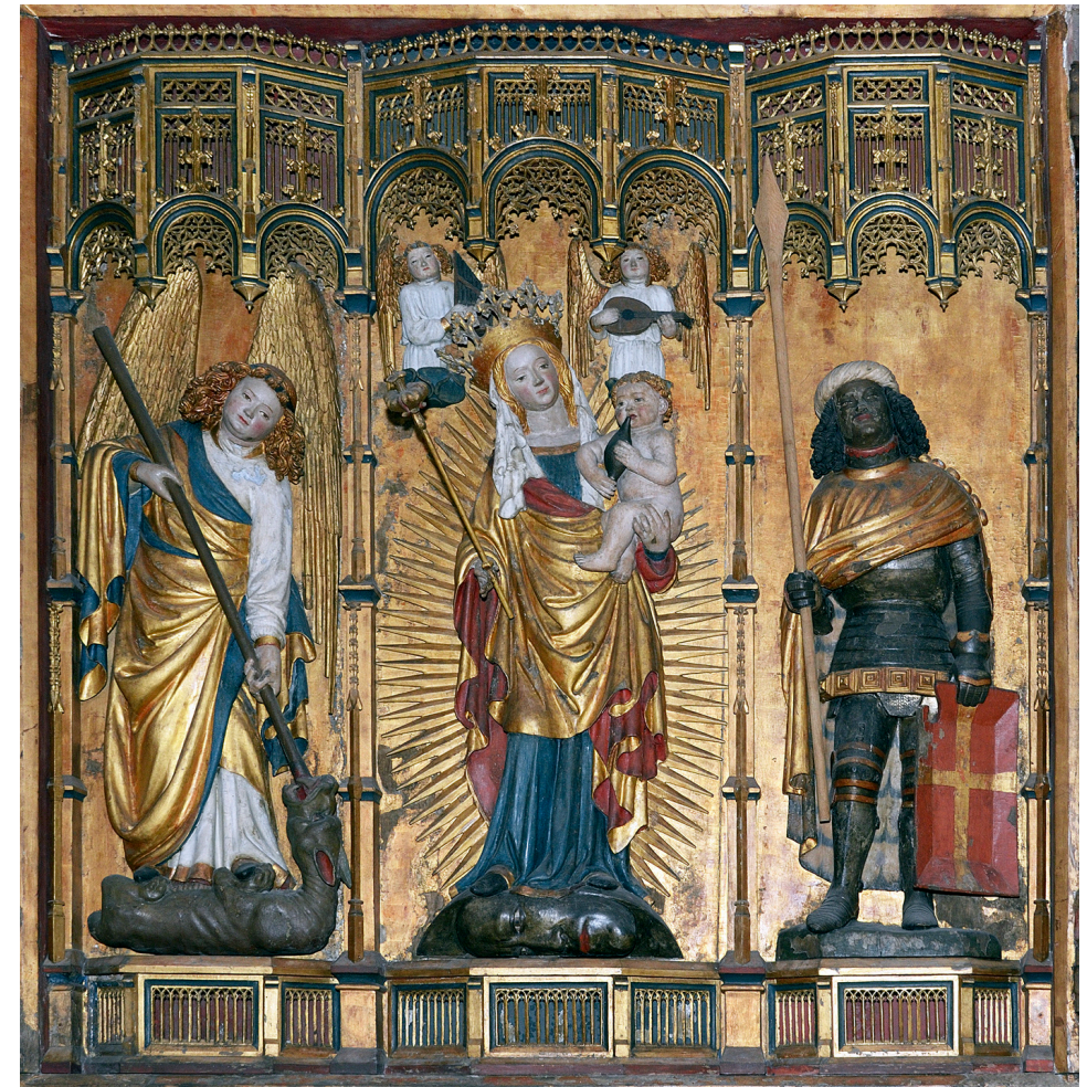
Fig. 6. St Maurice in the shrine of the Krämer altarpiece from St Mary's Church in Wismar, ca. 1430. St Nicholas' Church, Wismar.

close to medieval Livonia – one can find both black and white Maurices in the second half of the fifteenth and the first half of the sixteenth centuries, although few images of him have survived. In the Cathedral of Roskilde and in the churches of Östra Herrestad (Scania) and Högsby (Småland), the saint is depicted as a black African, whereas in the murals of the Linderöd, Vittskövle (Scania), and Skive Gamle (Jutland) churches he is a white knight, recognizable only by the inscription. 16 The concentration of his visual representations in the churches belonging to the Archdiocese of Lund can probably be