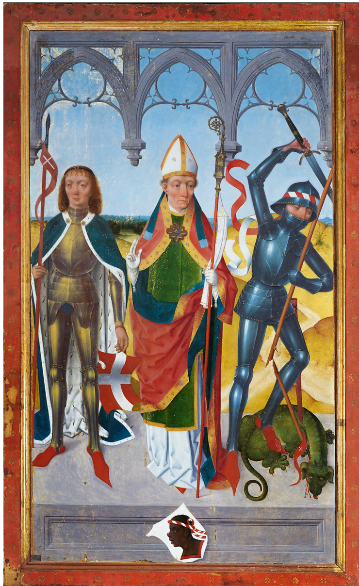
Fig. 1. St Victor, St Nicholas, St George and the coat of arms of the Black Heads. Outer wing of the high altarpiece of St Nicholas' Church, Tallinn. Hermen Rode, Lübeck, 1478–1481. Niguliste Museum, Tallinn.