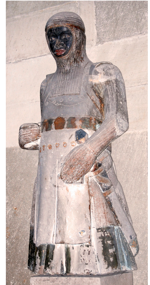
Fig. 4. St. Maurice, Magdeburg Cathedral.

Other positive persons to be represented as black included one of the Three Kings (Balthasar) and St Gregory the Moor. The city of Cologne, possessing the relics of these holy persons, played an important part in propagating their cult. 13 One can conclude that from at least the fifteenth