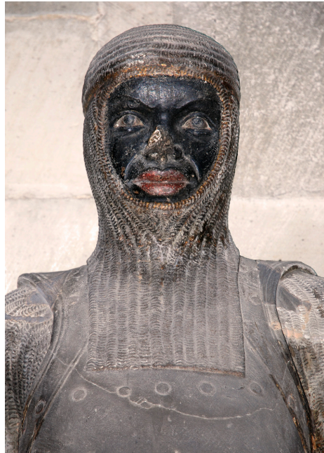
Fig. 3 (and fig. 4). St Maurice at the southern wall of the chancel of the Magdeburg Cathedral, ca. 1240. Sandstone, h. 110 cm.

As is commonly known, blackness in the Middle Ages had primarily a negative connotation. Since God is light, blackness incarnated the ugliness of evil and sin. The Devil and the demons were generally depicted as black. Enemies of the Christian faith, such as Jews and Saracens, and oth-