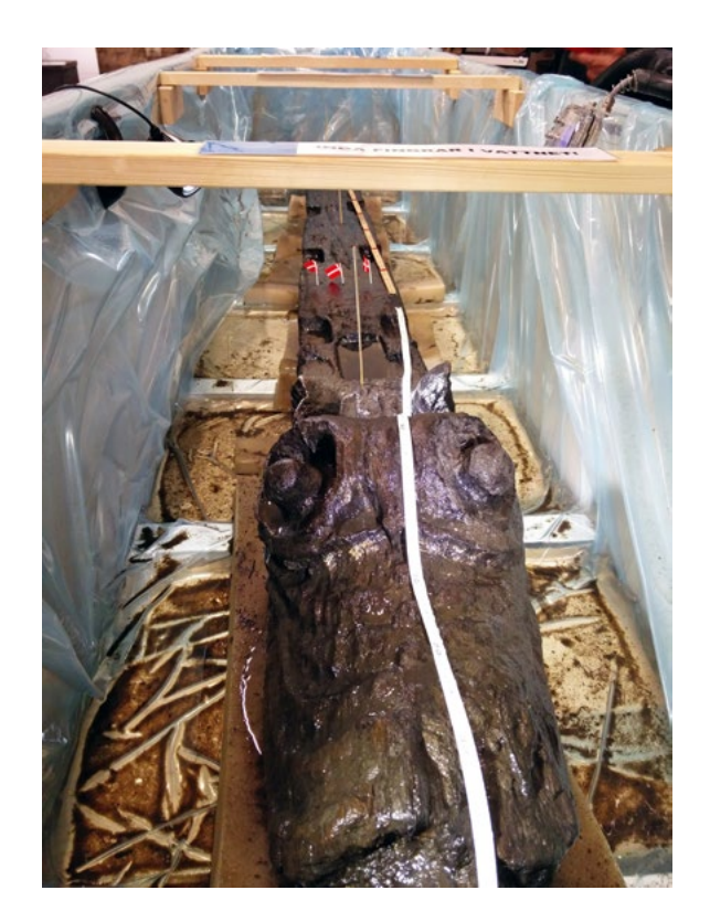
The Griffin head and the beam in the drained storage tank. The wooden pins and flags are placed in the holes where the density profiles were taken.

The aforementioned microbial attack usually means that the surface of the wood is soft, despite it appearing intact in dimension, shape and color. The surface feels very spongy, and a metal needle or nail can often simply be pressed by hand into the wood. This is because the bacteria have degraded the wood cell walls where, as mentioned, the substances lost are replaced by water as the wood breaks down. This phenomenon is reflected by the density of the wood; the more degraded the wood, the lower the density. To quantitatively