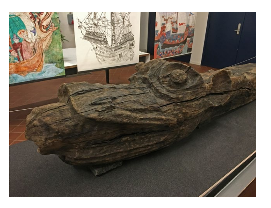
The figure head following conservation and ready to make the journey back to Blekinge.