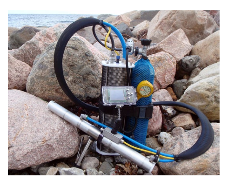
Prototype of the wood density profiler.

by sediment. However, if the wreck is totally buried in the seabed, the wood will not be degraded by these organisms due to limited dissolved oxygen in the water, which prevents their respiration. Instead, deterioration in the seabed is primarily caused by bacteria. Fortunately, these bacteria only degrade the celluloses and lignin within the individual microscopic wood cells that make up wood. However, they cannot totally degrade the compound middle lamella, which holds the individual wood cells together, and those parts that survive become filled with water, retaining the original form of the artefact. This is the case with the figurehead and wreck of the Gribshund . For the first, the waters in which she lies are brackish and the wood eating organisms like shipworm and gribble do not survive. Furthermore, it appears that the figurehead has lain inverted and buried in the seabed for most of the time since the ship sank and has only undergone very slow bacterial deterioration that is invisible to the naked eye. Thus, even though on the surface the figurehead looks well preserved, if it were left simply to dry, it would shrink and crack beyond recognition; hence the need for conservation (Gregory et al. 2012).