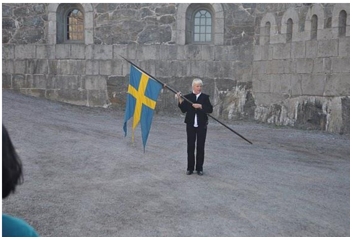
At the last Fortress Gate