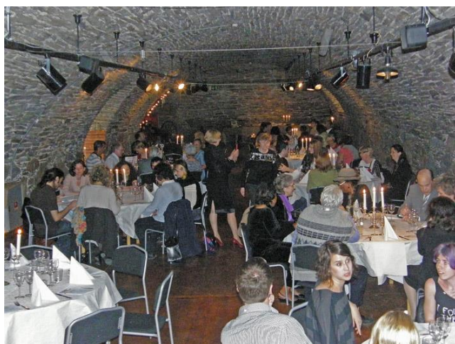
The banquet in the Hall of Knights at the Fortress