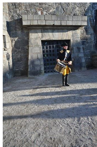
Carolinian guard at the first Fortress Gate.