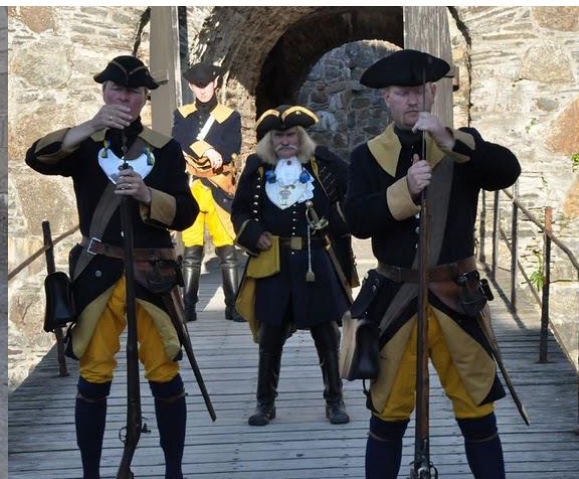
The commandant, his soldiers and the muskets