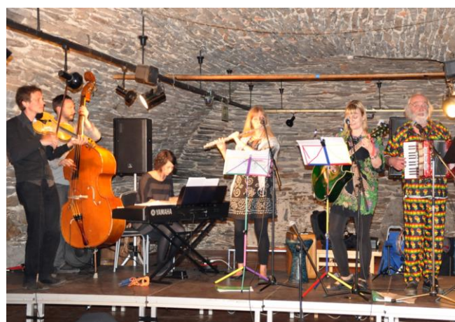
The musicians start.....