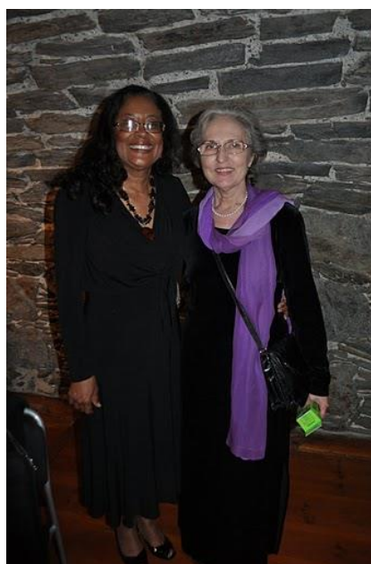
...or from different continents...Mississippi University and Lund University