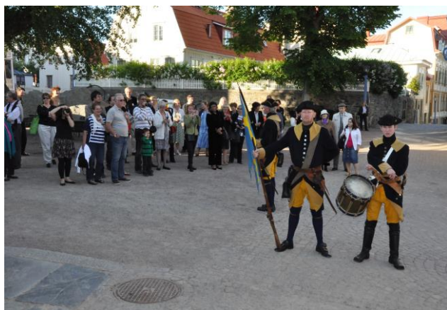
The Carolinian soldiers fetch us at the City Hall Square

At 19.30, the conference participants gathered at the City Hall to be escorted to the Fortress Cavalry Hall by Carolinian soldiers. At the King's gate we were greeted by the commandant who told brutal and fascinating tales of the fortress. Soldiers performed the loading and firing of old flintlock muskets from the 18 th century. In the Hall of Knights a magnificent buffet was served. Calabalâc played songs from the 14 nations represented at the conference and the guests joined in, singing along joyfully. After dinner there was more music and dancing.