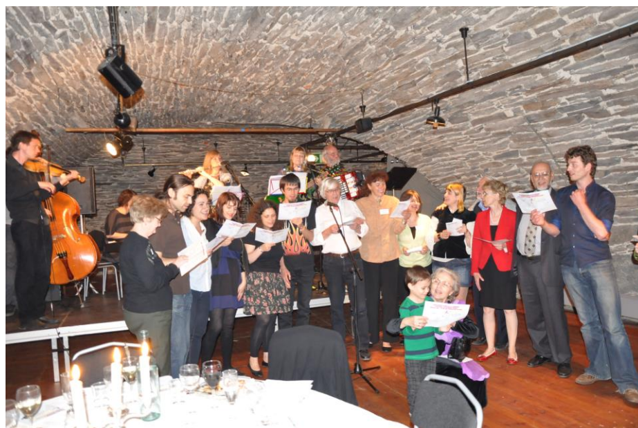
Sing along songs.... from 14 countries represented by the Paper-Presenters