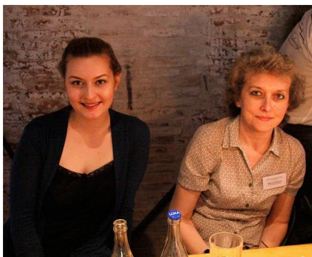
Conferees from the same country...Russia