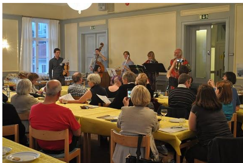
Romanian sing-along songs