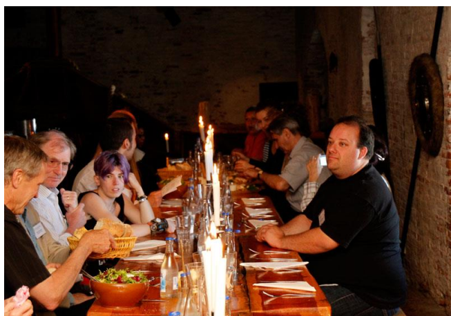
Lunch at the Fortress in the Viking Hall

Internet: The impact on design education and the creativity