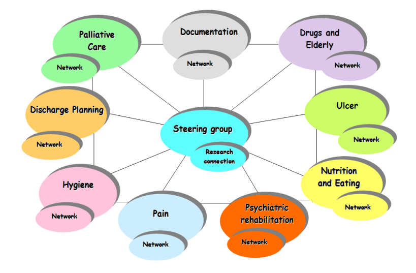
Figure 2: The nine R&D networks included in the research project. The figure was established by the steering group linked to the networks.

The network coalition had its starting point in 2002. The networks Palliative Care, Documentation, Ulcer and Pain existed independently before the start and were the first to become involved, while new networks took shape in gradual stages. When this research project was launched, eight networks had been established. The ninth network, Psychiatric Rehabilitation, was set up and became involved in the research project shortly afterwards. As mentioned in chapter five, the networks each consisted of between eleven and fifty practitioners, that is approximately 200 in total. The networks had network meetings from two to six times a year, lasting from two to six hours on each occasion. All network participants participated in these meetings during working hours.