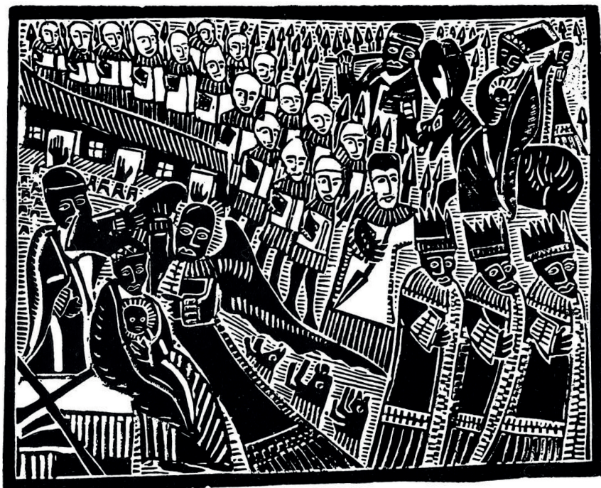
Figure 1. Azaria Mbatha, Nativity, c. 1970.