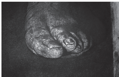
Figure 4 (left). Paul Stopforth, Biko Series (left hand), 1980. Figure 5 (right). Paul Stopforth, Biko Series (detail), 1980.