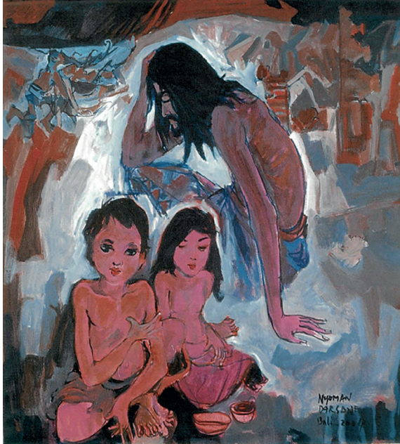
Figure 13. Nyoman Darsane, Empty Stare , 2004.