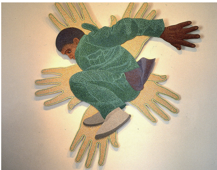
Figure 6. Paul Stopforth, Freedom Dancer, 1993.