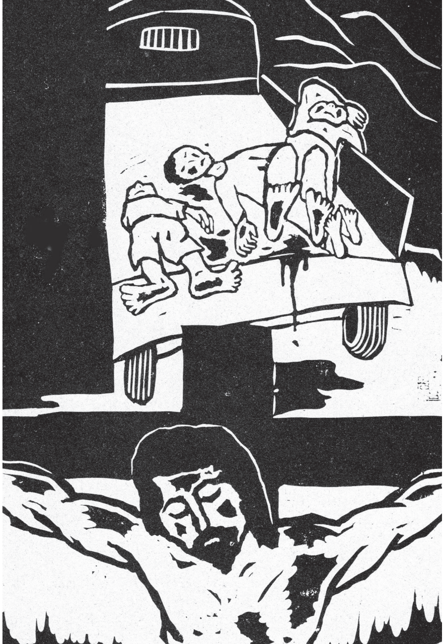
Figure 7. Hong Song-Dam, Kwangju, 1980s.