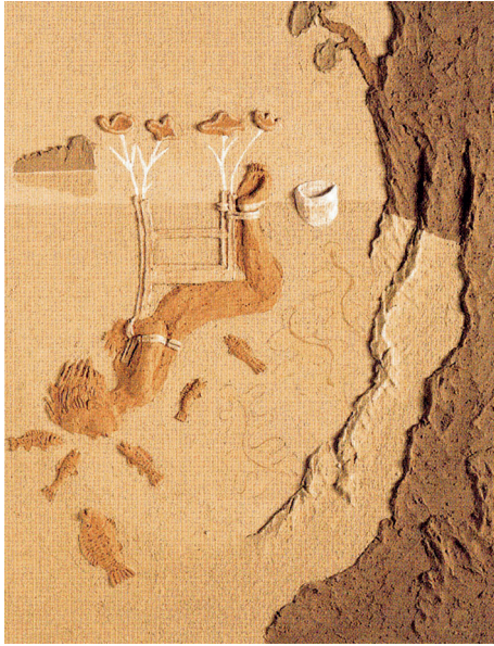
Figure 8. Hong Song-Dam, Twenty Days in Water I, 1999.