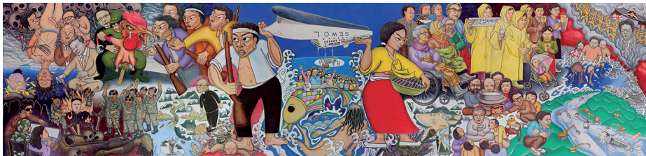
Figure 10. Hong Song-Dam, Sewol Owl, 2014.