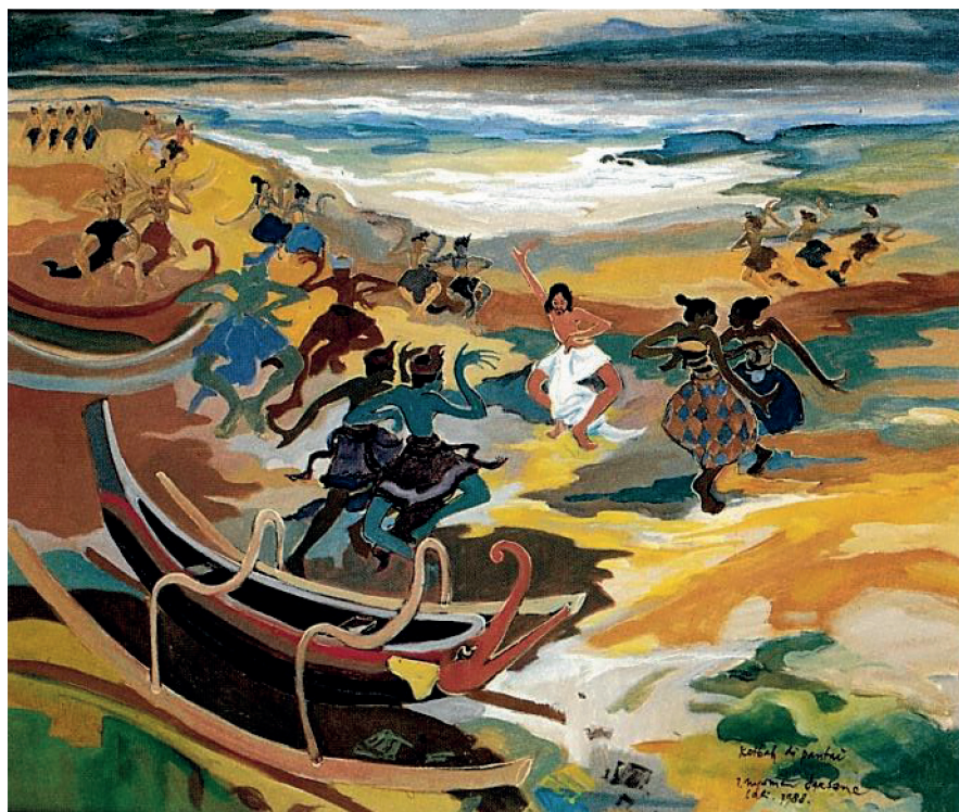
Figure 11 (above). Nyoman Darsane, Sermon by the Seaside, 1988.