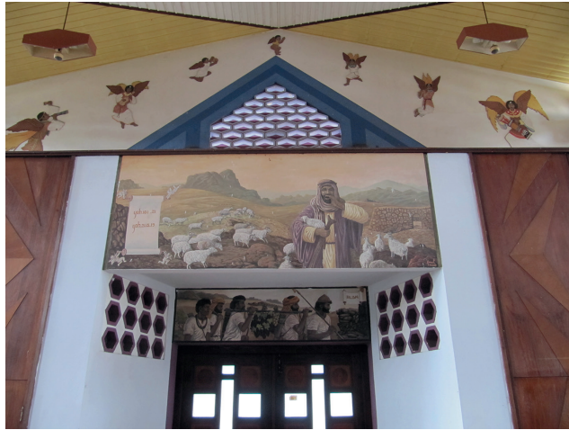
Figure 15. Donatus Moiwend, Cathedral of Jayapura.