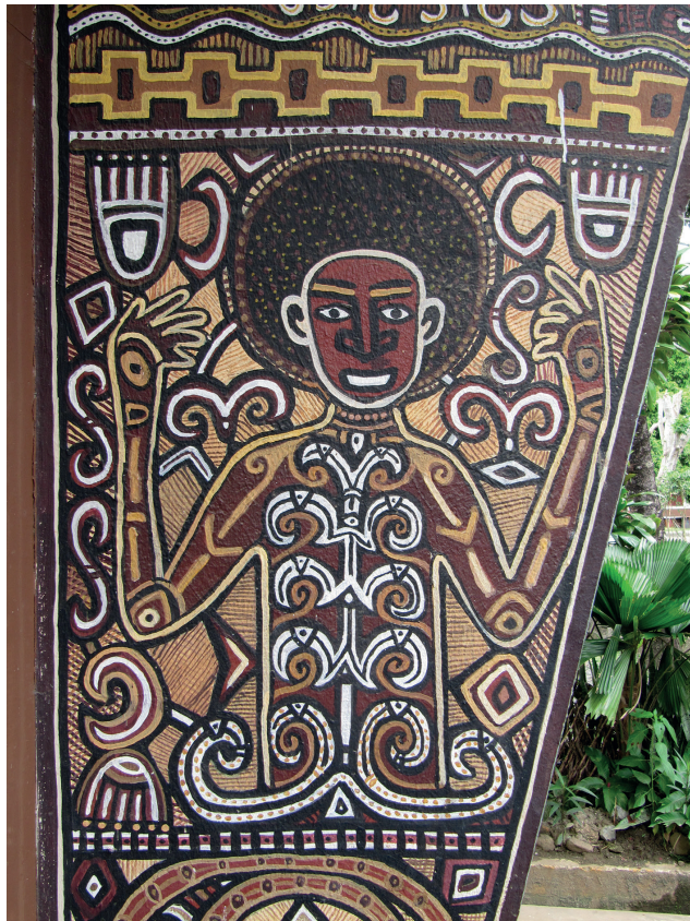
Figure 16. Donatus Moiwend, Hawaii-Chapel.