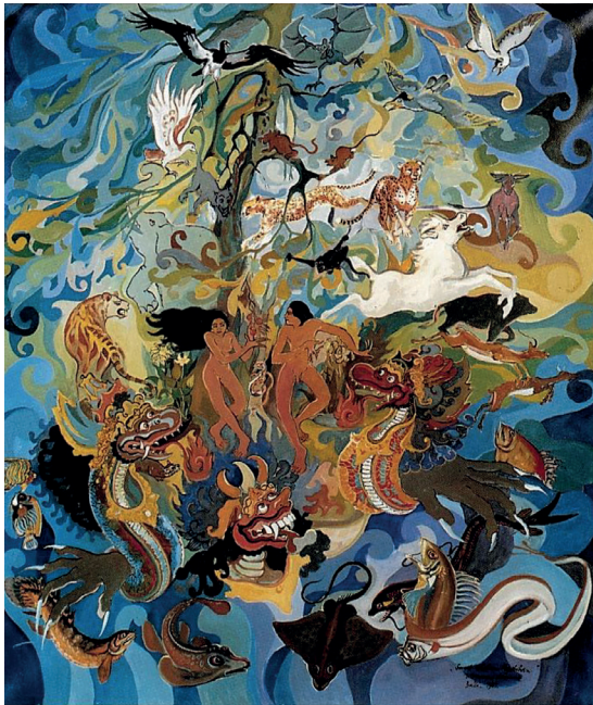
Figure 14. Nyoman Darsane, Five Minutes before the Fall , 1980s.