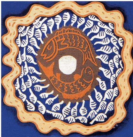
Figure 9. Hong Song-Dam, Twenty Days in Water 7, 1999.