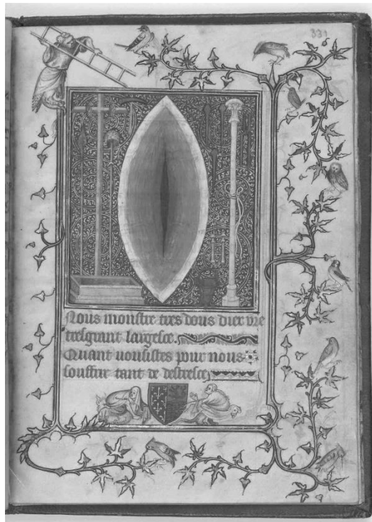
Above: Jean le Noir, Christ's Side Wound , Psalter of Bonne de Luxembourg (c. 1349)