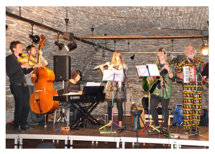
The musicians start.....