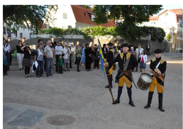
The Carolinian soldiers fetch us at the City Hall Square

At 19.30, the conference participants gathered at the City Hall to be escorted to the Fortress Cavalry Hall by Carolinian soldiers. At the King's gate we were greeted by the commandant who told brutal and fascinating tales of the fortress. Soldiers performed the loading and firing of old flintlock muskets from the 18<sup>th</sup> century. In the Hall of Knights a magnificent buffet was served. Calabalâc played songs from the 14 nations represented at the conference and the guests joined in, singing along joyfully. After dinner there was more music and dancing.