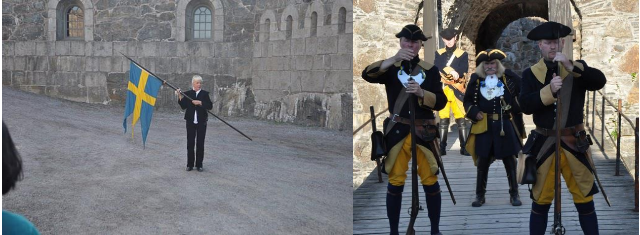
At the last Fortress Gate