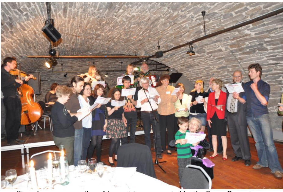
Sing along songs.... from 14 countries represented by the Paper-Presenters