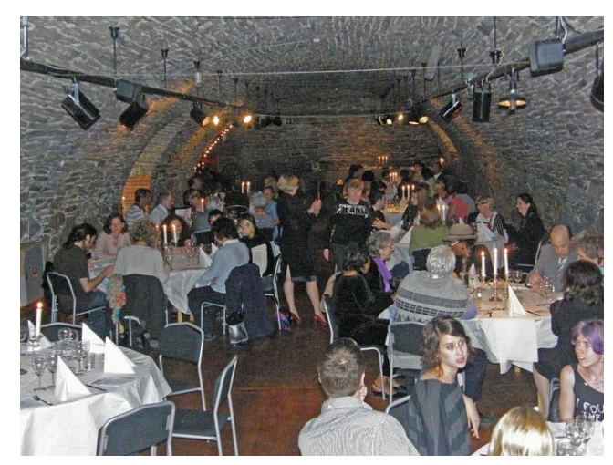
The banquet in the Hall of Knights at the Fortress