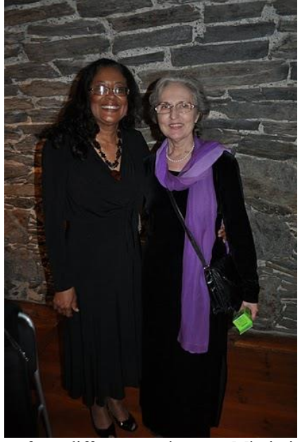
...or from different continents...Mississippi University and Lund University