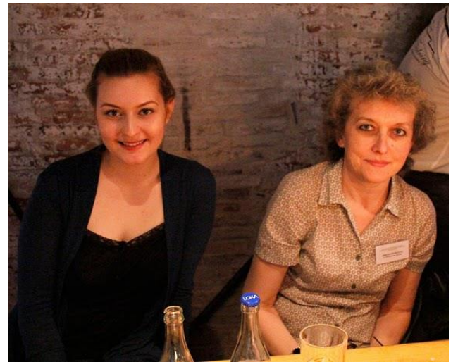
Conferees from the same country...Russia