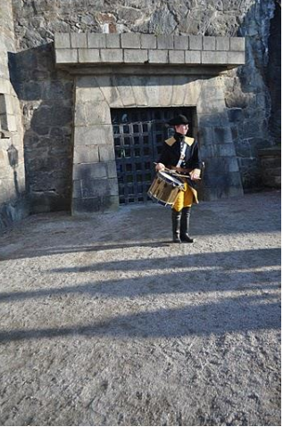
Carolinian guard at the first Fortress Gate.