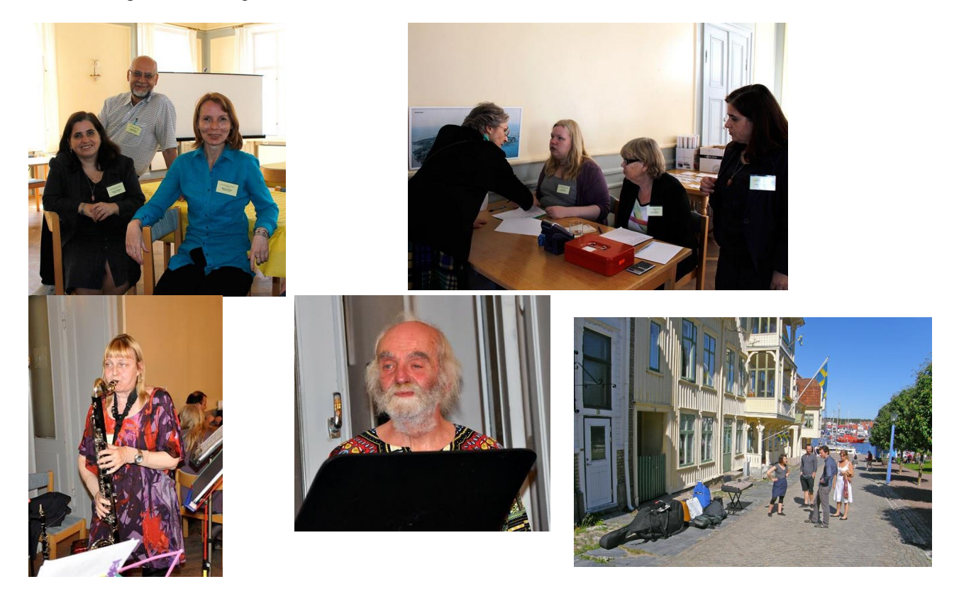
... and for coming all the way ..... from: Solomon Islands ..... S